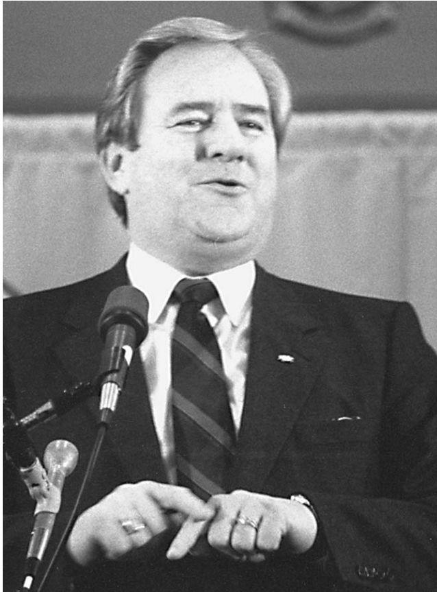
Jerry Falwell's magazine lavishly praises prosecutor Kenneth Starr, "the man who could topple the President."