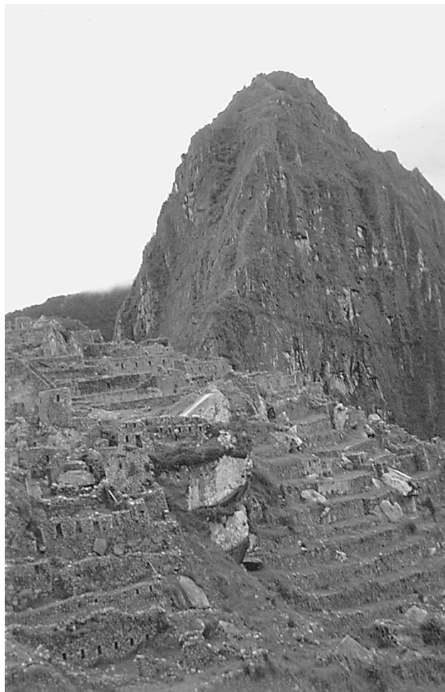
Peru's Huaynapicchu Mountain. "If we look at some of the undeveloped areas, the highland areas," said LaRouche, "we realize that Peru is an excellent investment proposition, if it's given the means to build the infrastructure, and also get the credit to develop the kinds of industries which fit its opportunities, and which enable it to raise its productive powers of labor."

Now, the derivatives market, the major financial market today, the over $300 trillion of short-term obligations which are crushing the world, the most explosive part of the thing, these things are nothing but gambling side bets. My approach to these, is, cancel them. Tell the debtors and the creditors—just mutually cancel the whole thing. It's a pure waste of time, it's only gambling. It is not investing, in the sense of investing