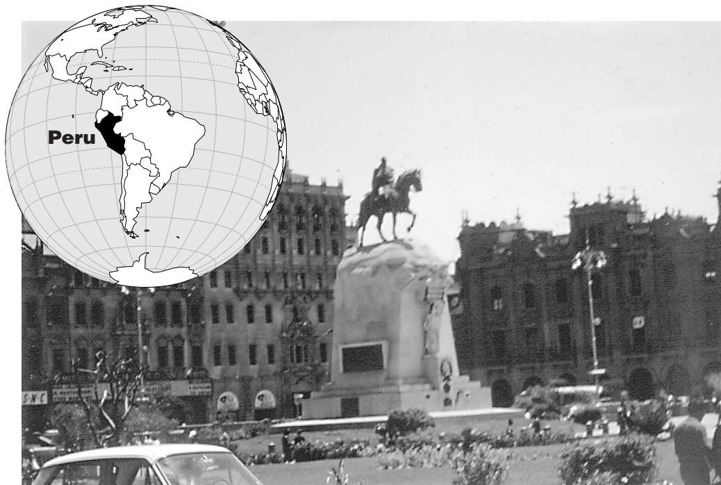
Bolívar Square in Lima, Peru. Lyndon H. LaRouche, Jr. briefed Peruvian public accountants, economists, and public figures on the world economic crisis and what must be done to turn it around, in a Feb. 25 videoconference.

inflationary effects inside the German economy, because the pressures were also deflationary in the economy at the same time. But beginning about the end of the spring and through the summer, the German economy began to explode in a hyperinflationary spiral, such that by October-November of 1923, the Reichsmark was bankrupt. The printing presses could not keep pace with the rate of hyperinflation of prices.