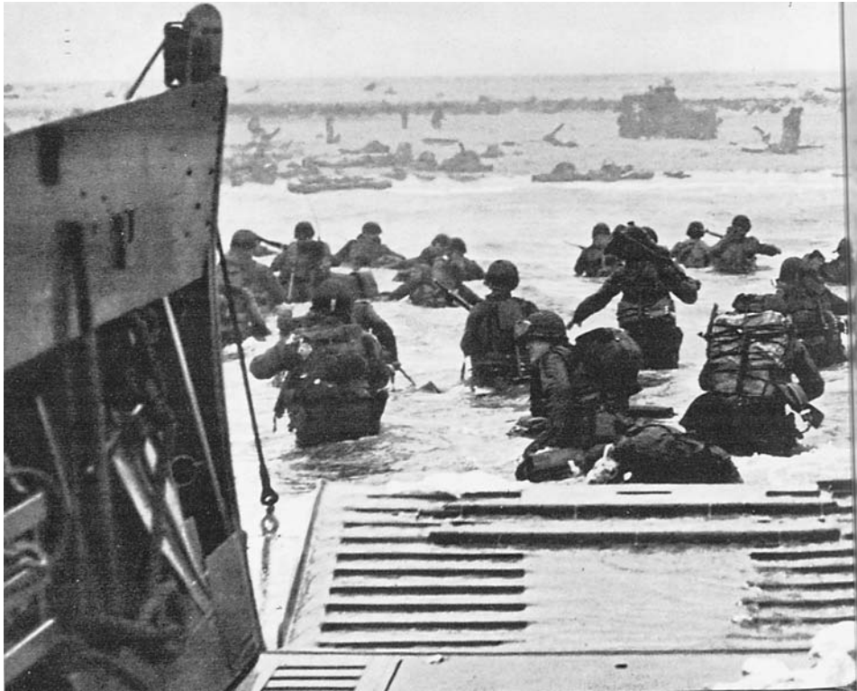
The Normandy landing on D-Day, June 6, 1944. Because of the determination of Jean Monnet and Franklin Roosevelt, between Pearl Harbor in 1941 and D-Day in 1944, U.S. auto-makers had re-tooled their assembly lines, producing 171,000 aircraft engines, at a rate of 6,000 a month.

intended to rally Russia to his postwar new, just order, through the advantages of common development, the Marshall Plan was soon embroiled in the logic of the Cold War. The European leaders of today, who blame the naiveté of Roosevelt and admire the “realism” later shown by Churchill and Truman, understand nothing about what was at stake back then. Roosevelt’s vision, as we have described it, led him to respect the national sovereignty of states, and to uphold social justice for all men, while Churchill’s, imperial and financial, was nothing more than that of the Anglo-American cabal, based on looting and globalist one-world rule, which Roosevelt had fought and temporarily won out over within the United States.