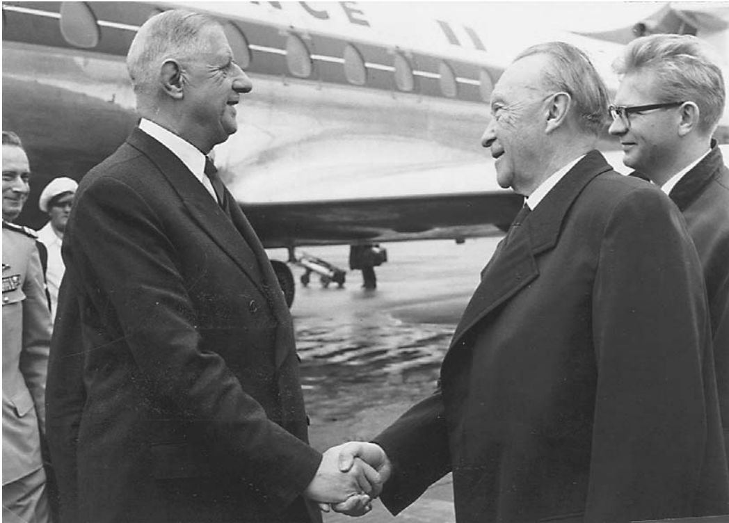
French President Charles de Gaulle (left) with German Chancellor Konrad Adenauer, Bonn 1961.