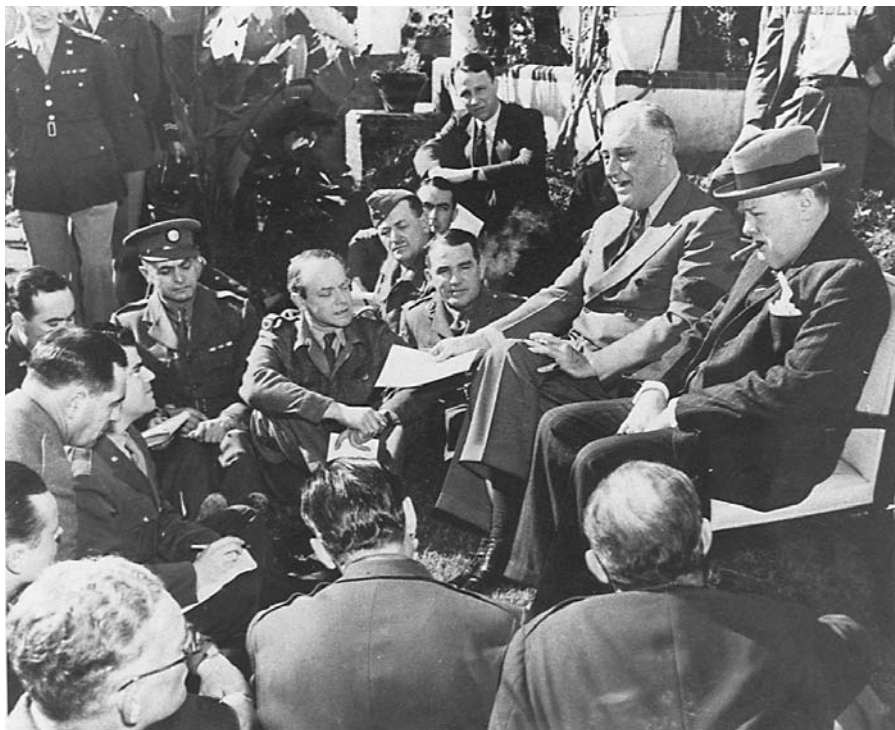
President Roosevelt with British Prime Minister Winston Churchill at Casablanca, January 1943. On another occasion, when the two were discussing the future of Britain’s colonies, Roosevelt said, “You see, it is along in here somewhere that there is likely to be disagreement between you, Winston, and me.”

Roosevelt’s postwar grand design was that of a “Global New Deal,” to achieve at the level of world politics what he had undertaken within the United States. Two things have to be immediately stressed. First, it is only Lyndon LaRouche