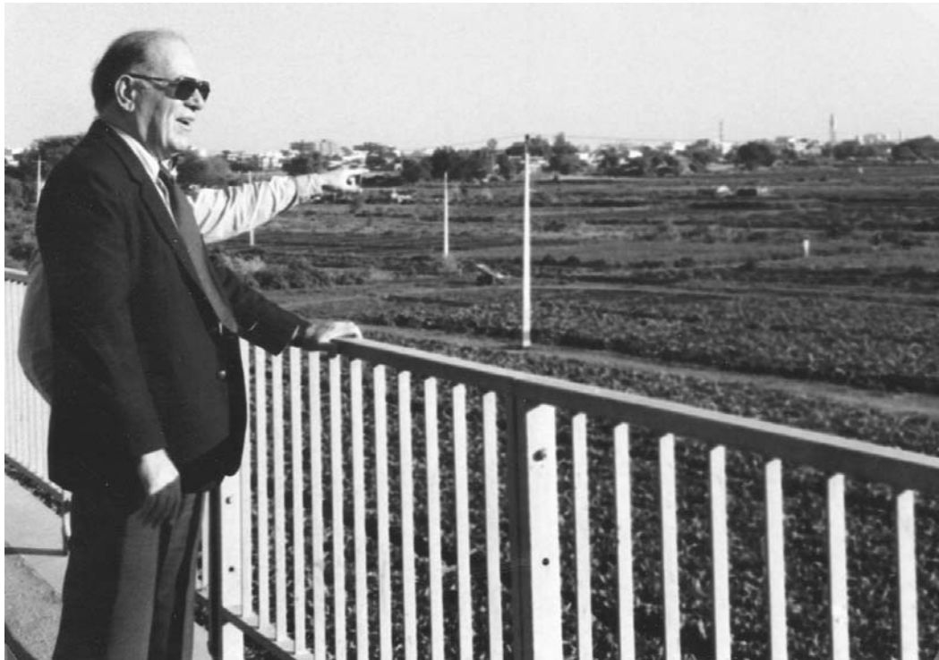
Lyndon LaRouche on a bridge over the Nile River in Sudan, December 1994.

States of America, but others were involved. Secondly, it has become an organ of the United Nations Organization, with the same story. When it becomes bankrupt, we have to create a new institution; we may not call it the IMF, but we have to put the IMF into a bankruptcy reorganization.