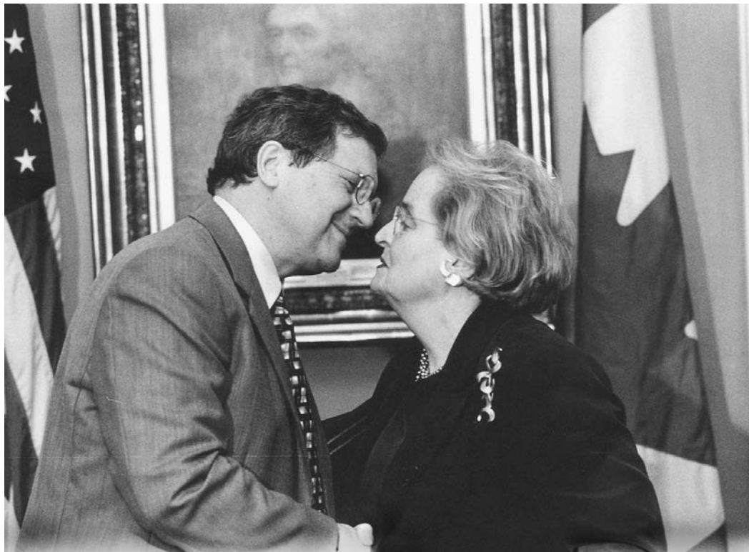
U.S. Secretary of State Madeleine Albright with Canadian Foreign Minister Lloyd Axworthy, on June 13 in Washington. "What they are trying to do is wear down Peru," LaRouche charges. "The object is to get Peru into NAFTA. As a matter of fact, the intent is to get the entire hemisphere into NAFTA."