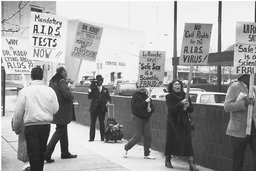
A 1987 demonstration by LaRouche supporters in Philadelphia against Surgeon General C. Everett Koop, who denounced Proposition 64 and said the main focus of anti-AIDS efforts should be sex education.