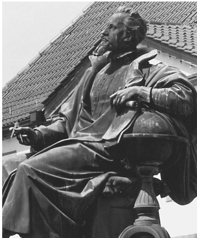
Statue of Johannes Kepler (1571-1620) in Weil der Stadt, Germany.

As the most ancient known Zodiacs indicate, mankind's first systematic astronomy measured the angular changes, not