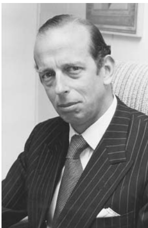
Duke of Kent, Grand Master of United Grand Lodge of England, the mother lodge of World Freemasonry.