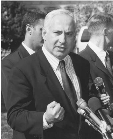
Benjamin Netanyahu, former Likud party Prime Minister of Israel.