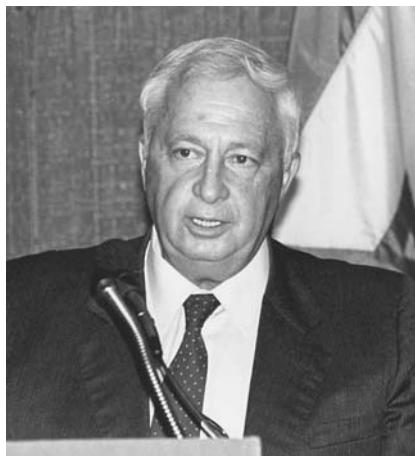
Ariel Sharon, Likud Party chief, who is vying to be Prime Minister of Israel. Sharon provoked the current Holy War in the Middle East. A call has been issued by Arab leaders to try him for war crimes.