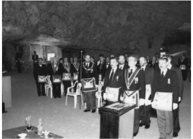
The founding ceremony of the Jerusalem Lodge of Di Bernardo's Regular Grand Lodge of Italy. The location is the "Grotto of King Solomon," an underground cave in the Arab Quarter near the Temple Mount.