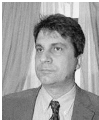
British-based terrorist leader Roberto Fiore.

and “St. Michael the Archangel,” were covers for neo-Nazi training camps in Spain, the British Charity Commission started a public investigation, but reached the strange conclusion last year, that the charges were not true.