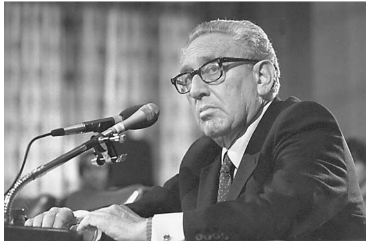
Council on Foreign Relations “Asia specialist” Winston Lord (left) and aging Mephistopheles Henry Kissinger. Though not in the new Bush Administration as yet, they have moved immediately to set a Bush “crisis management team” on a collision course with China and Russia, in the midst of a worsening economic crisis.

abandon those principles which would doom it, and accept a reasonable alternative, the new administration could survive the coming crisis rather well. What if it chooses not to make such imperative changes in its profile? Then, it is doomed to undergo a catastrophe of its own making, and that soon.