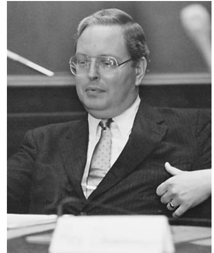
Televangelists Jerry Falwell and Pat Robertson, and Christendom College founder Paul Weyrich. The religious right gathering of gnostic “political theocracy,” is the Bush league’s fascist mass-base for launching a “universal fascist” world order.

lege’s gnostic orbit. On all of the fundamental issues of statecraft, law, and of theology, too, no competent judgment can be presented, until it has been developed from that Classical standpoint in natural law from which the U.S. 1776 Declaration and Independence and 1789 Preamble of the Federal Constitution were derived. Therefore, all competent definitions of phenomena such as gnosticism in general, or the gnostic theology of Christendom College’s practice, must be rigorously grounded from that very same standpoint in natural law which Scalia has rejected as abhorrent to him.