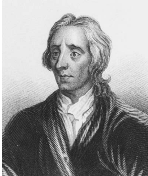
Adam Smith (left) and John Locke, who believe that “the rich and prosperous class is the rich and prosperous class, only because the ‘little green men’ have arranged it thus. . . . When that dogma is adopted as a presumably universal moral authority, we have a corresponding form of the worst kind of heathen cult, of the type known, traditionally, as gnosticism.”

consistent with its custom, produced a modified version of the Manichean cult, a form of gnosticism, modelled upon the Manichean, but adapted to the Slavic cultural influences, a lunatic cult which became known as the Bogomils.