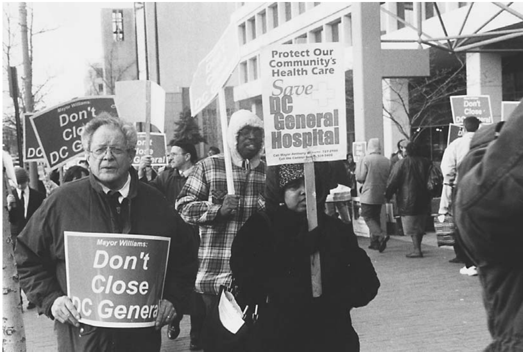
A rally to save D.C. General Hospital in Washington, D.C. The attempt of the Bush Administration to keep an unsustainable system together, by dictatorial methods, is running into a headlong collision with other nations, and with those in the United States who still believe in the general welfare clause of the Constitution.

comes in the order of 15%, at 23%, borrowing costs, for this kind of thing.