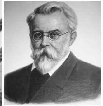
The work of scientist Vladimir I. Vernadsky laid the foundations for Eurasian development projects, to develop what he termed the “noösphere”: the domain of human cognitive activity, as a process that shapes non-living processes, including the geology of the Earth itself. Left: construction of a pipeline in the former Soviet Union.

you’re taught in most universities about science is nonsense — it’s a damn lie, to put it frankly. What you’re taught as basic physics is mostly a lie. Because, as Vernadsky demonstrated this in his own way, and as others have shown, there are actually three principles involved in man’s physical relationship to the Earth and the universe. Three categories. One is what we call non-living processes, what most call physical processes. The second, which those in molecular biology refuse to understand, is the principle of life; you will never get life out of a non-living process. Life is, as Pasteur insisted, a principle unto itself, a universal physical principle which, as Vernadsky demonstrated with his biogeochemistry, the oceans and the atmosphere were produced by living processes, down several kilometers below the Earth’s surface. Most of the Earth that we are in touch with as humanity was created was a by-product of living processes, with what Vernadsky calls the “natural products of the biosphere.” We can measure the power of the biosphere over the non-living processes, we can measure it!