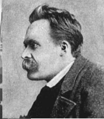
President George W. Bush is a Nietzschean personality, whose characteristic mental state, like Adolf Hitler at a Nuremberg rally, is “the triumph of the will.” Left: Bush tries to get his lines straight. Right: his mentor, Friedrich Nietzsche.

within the Republican Party, represented by a President who’s an integral part of that. This man is a Nietzschean personality, and if you’ve watched some of the things that he’s done, and his administration has done, they do not consider the consequences of their actions. What they have done, as financial emergency actions, were stupid. Absolutely stupid. What they have done will make everything worse. They will not control anything. They will make nothing better. They will control nothing. They’re going to go from crisis to crisis, as you see the case of this Sharon phenomenon.