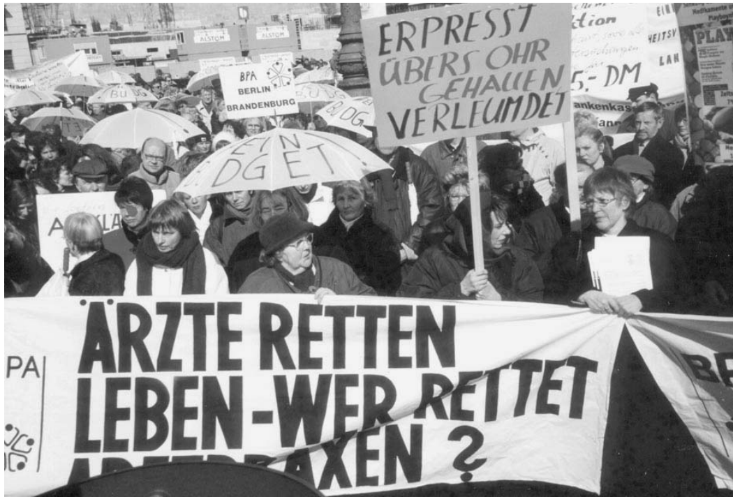
German doctors demonstrate against health budget cuts, March 2001. "Germany is at a point that it cannot survive, and Western Europe cannot survive, the way things are going."

used by a trans-oceanic maritime culture, functioning over a long period of time when most of North Eurasia was under a giant glacier, for about 100,000 years. During that period, most of what later became civilization, was running around the oceans. From the time that these maritime cultures came back into Eurasia following the melting of the glacier about 20,000 years ago, when that began, they began to move inland. The first direction was to move along the great riverways inland, to move along the coastways, close to the seas and to maritime traffic. If you look at the map of the world, you find the characteristic of long development is the lack of the ability to utilize the inland areas, the land-locked areas, of the world, with the same degree of efficiency and productivity that was used in the coastal areas and chief riverways.