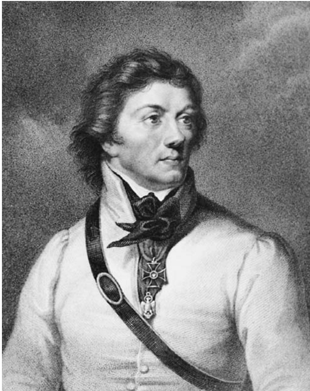
Keep fighting until we win “is an old Polish custom. That’s why Poland exists.” Thaddeus Kosciuszko, the most world-famed of Polish national liberation fighters, led the uprising of 1794 against Russian rule, and was a key collaborator of Gen. George Washington in winning the American revolution.

which is not exactly fruitful for human habitation, including Central Asia, and even the tundra areas of North Asia, will become areas in which the natural resources which lie in those areas, would now become economically accessible to the nations as a whole.