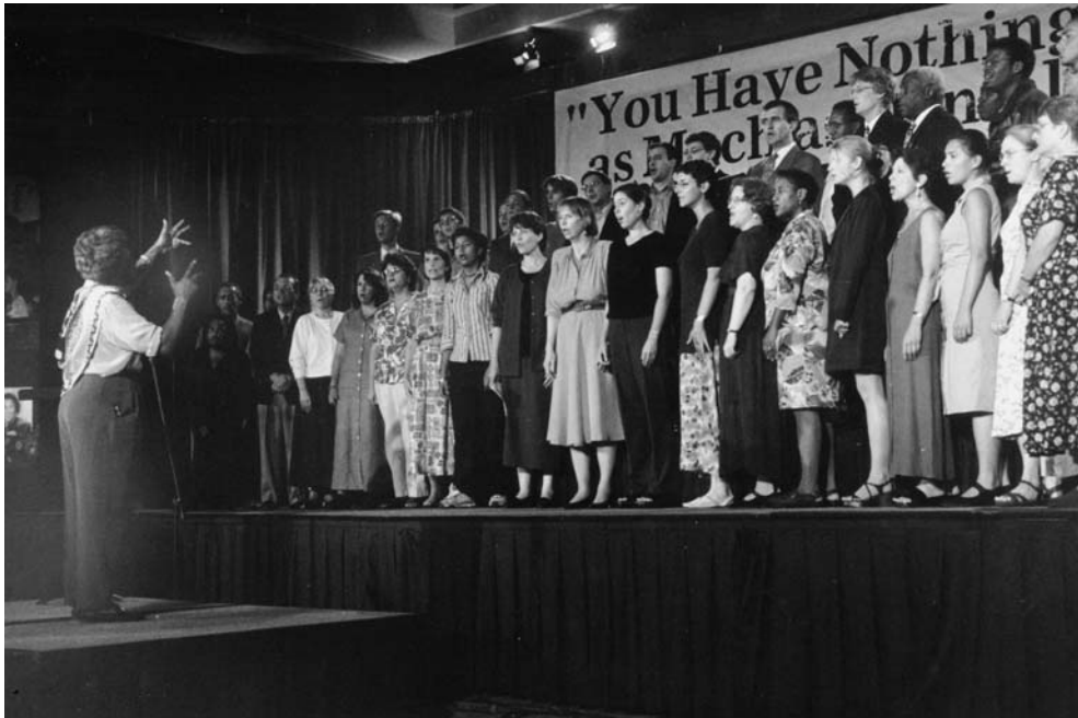
A combined Schiller Institute chorus from Los Angeles, Houston, and Philadelphia sings a Negro spiritual at the conference.

the children of my generation, went crazy. It was called the rock-drug-sex counterculture.