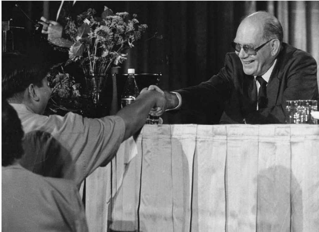
Lyndon H. LaRouche, Jr. greets supporters, at the Labor Day conference.

universities, for example, who had learned very much, but know virtually nothing. Because they never really had any fun . They learned . They were too busy learning, to have fun. Now, what's fun? Fun, as described by Friedrich Schiller, and others, is what a happy puppy does; what a happy young horse does. They have fun! They play! If you have a pet, the pet wishes to play! If you don't play with the pet, the pet is unhappy. How do you train a horse: You play with it! The horse likes to play! And, you play a game with the horse, that the horse likes. The horse accepts your leadership, as a human being, in playing . That's how you deal with animals. It's how you raise cattle; it's how you raise sheep: You play with them. Because playing is the highest quality of character of an animal. And domesticated animals, are those which have become accustomed, not merely to being handled by people, but playing with people.