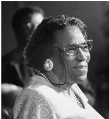
At the Labor Day conference, the Schiller Institute celebrated the 90th birthday of civil rights veteran Amelia Boynton Robinson (left), with musical contributions from young and old, from around the country.