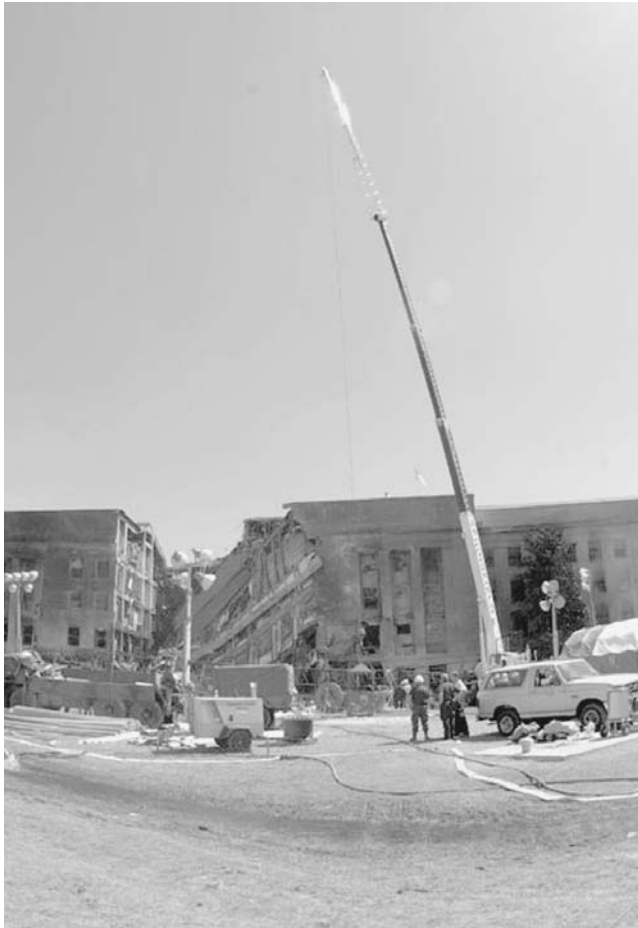
Search and Rescue teams at the Pentagon on Sept. 12.

big protection. And it's not just from a section of the Pakistani government or Afghanistan. It's from other governments who would like to see the effects that Osama bin Laden produces thrown around.