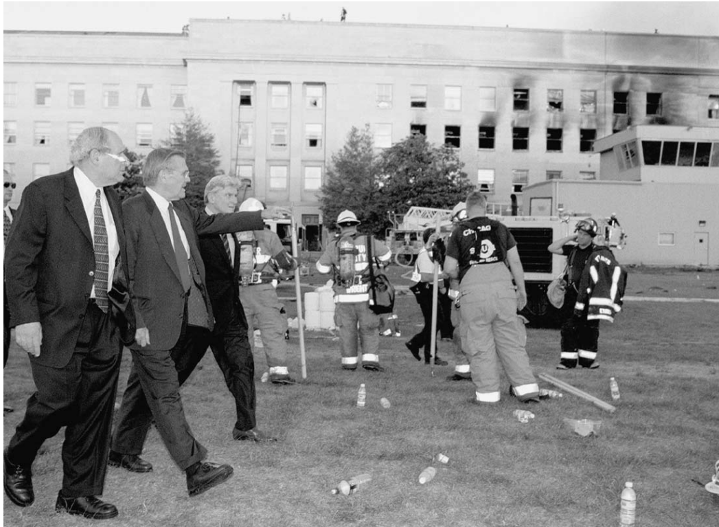
The scene of devastation at the Pentagon on Sept. 11, as Secretary of Defense Donald Rumsfeld (center) inspects the area with Sen. Carl Levin (D-Mich., left) and Sen. John Warner (R-Va., right).

for two hours this morning. This morning's schedule, in about another 10 minutes, is Lyndon LaRouche, an already preannounced candidate for the 2004 election in the Democratic Party.