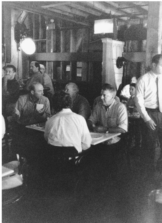
Grim-faced patrons in a restaurant near Dulles Airport in Virginia, monitor the news of the terrorist attack on Sept. 11.