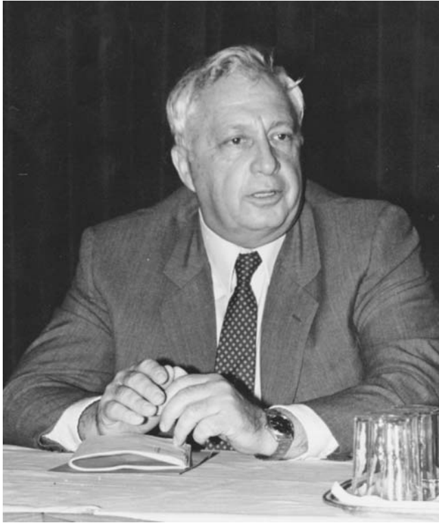
Ariel Sharon, Israel's Prime Minister and a prime beneficiary of Mega Group funding and political machinations to wreck the Israel-Palestine peace process.