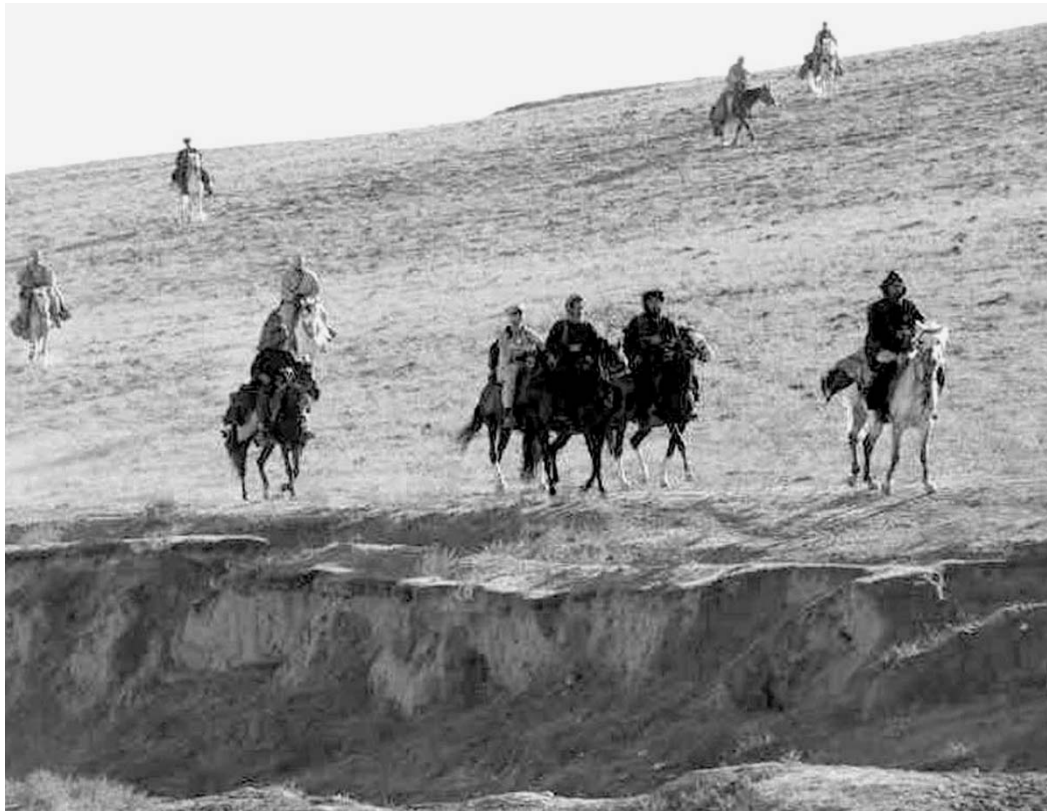
U.S. special forces in Afghanistan. “The Afghanistan war is a hoax! There are real elements to it; there are real causes for it. but it has nothing to do with Sept. 11.”

cell operation, is a brainwashing operation, which is intended to degrade the conception of man. And, it’s a criminal thing: There’s no reason to do it. None whatsoever. Because you don’t have to get T-cells from embryonic T-cells: You get the best T-cells, the most appropriate for any person, are in that person themselves; if you can extract them, and culture it.