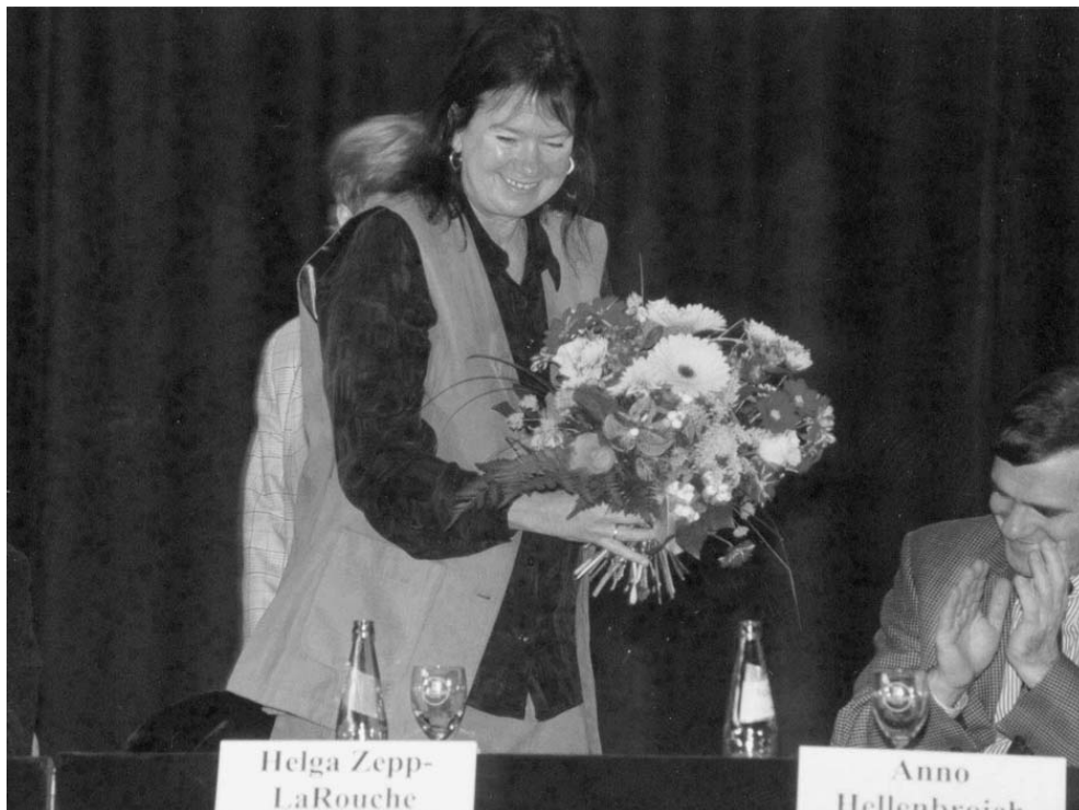
Chairwoman of the Bürgerrechtsbewegung Solidarität, Helga Zepp LaRouche, is presented with flowers at the party's congress in Mainz, where she and Lyndon LaRouche gave major addresses to more than 200 delegates and others.

sense, talking to one side of the National Security Council (the top part), to which I was doing what became known as the SDI, as a policy. And, on the other extreme was Oliver North, and George Bush (the father), and some other people, who were my enemies. Now, these guys who were my enemies, were the guys who were running this kind of warfare: It was called "Iran-Contra." Drug-financed, weapons-trafficking-financed, private mercenary armies, recruited from all over the world, and used as a substitute for regular military forces.