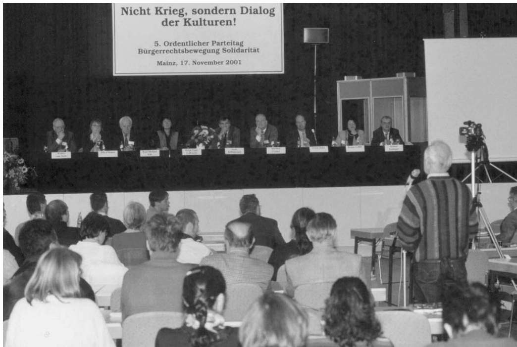
The leadership of the Civil Rights Movement Solidarity party (BüSo) listens to floor discussion during the party's annual conference in Mainz, Germany, on Nov. 17.

logue, which is a dialogue of cultures, centered on agreement to one principle in common: That man and woman are made, equally , in the image of the Creator of the universe.