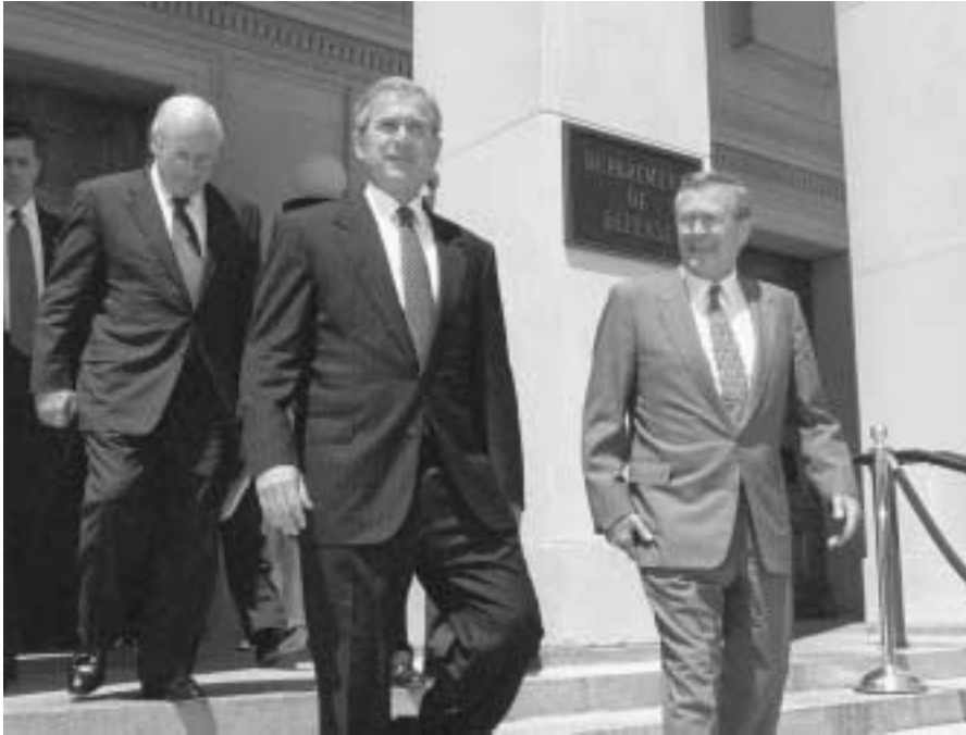
“Mr. Cheney must be appreciated as speaking publicly for effect” on preparations for an Iraq war, and its impact on the Middle East as a whole, “just as the usual practice of the [Bush] Administration has been on virtually every other topical area, and increasingly so, over the course of recent months.”

exist alternatives for the present global economic collapse, but no alternatives which are acceptable to the leading, entrenched desperadoes in Israel and the U.S.A. Only if they are forced to accept alternatives they would not willingly tolerate, is there any hope of avoidance of the very worst outcome from this present period of global crises.