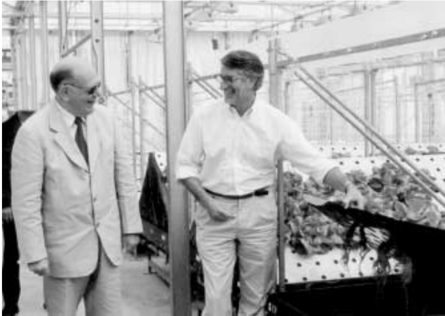
LaRouche visits an advanced aeroponics facility in Vicenza, one of the cities of Lombardy whose innovative, small and medium-sized entrepreneurial firms give it 20% of all Italian production.

classroom teacher or someone else, you came to recognize whether this discovery you thought you'd made, was true or not. Then, you both had had the experience; now you can share that experience, and cooperate. That was a good scientific education: that you shared the experience of discoveries, made by people from many thousands and hundreds of years before.