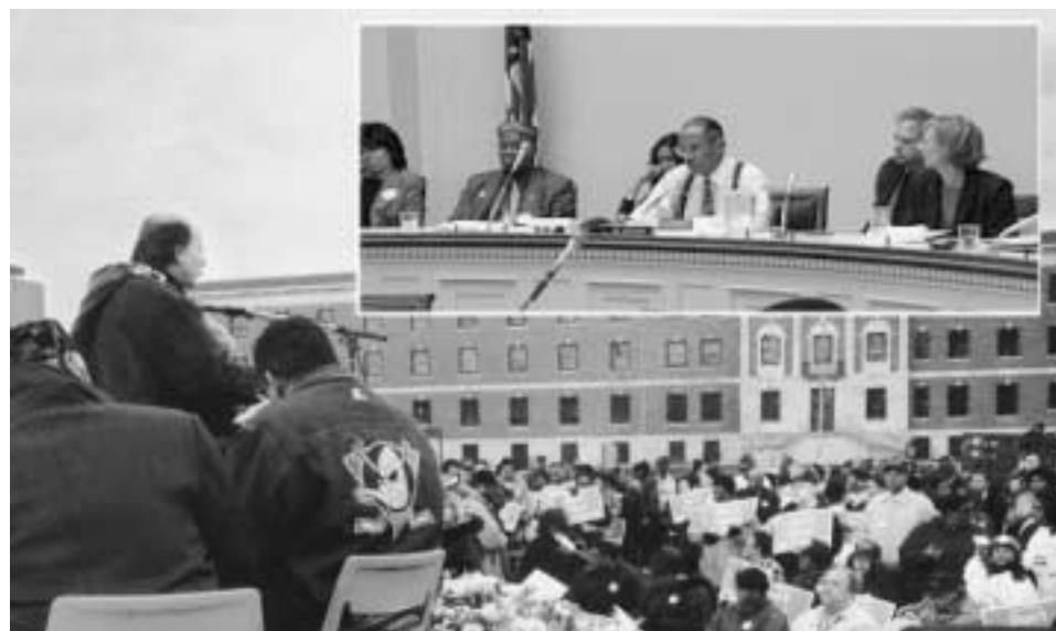
Congress has inescapable responsibilities which go back two centuries, for the provision of a full-service, teaching and research hospital at the site of D.C. General (here, a March 2001 rally against its closing). LaRouche renews that fight in the post-Sept. 11 situation, and makes a new proposal.

Over a period of more than three decades to the present date, there had been a trend in national policy and practice, away from the Constitutional commitment to promotion of the general welfare, toward an increasingly radical notion of what is sometimes named "shareholder value." With the rising flood-tide of global monetary-financial and economic crises, the United States, like other nations, is being impelled, of necessity, to return to what some prefer to name as "protectionist" measures, and to economy-rebuilding policies referencing successful features of the U.S.-led recovery and reconstruction programs of the Americas, Europe, and Japan during various phases of approximately the 1933-1965 interval.