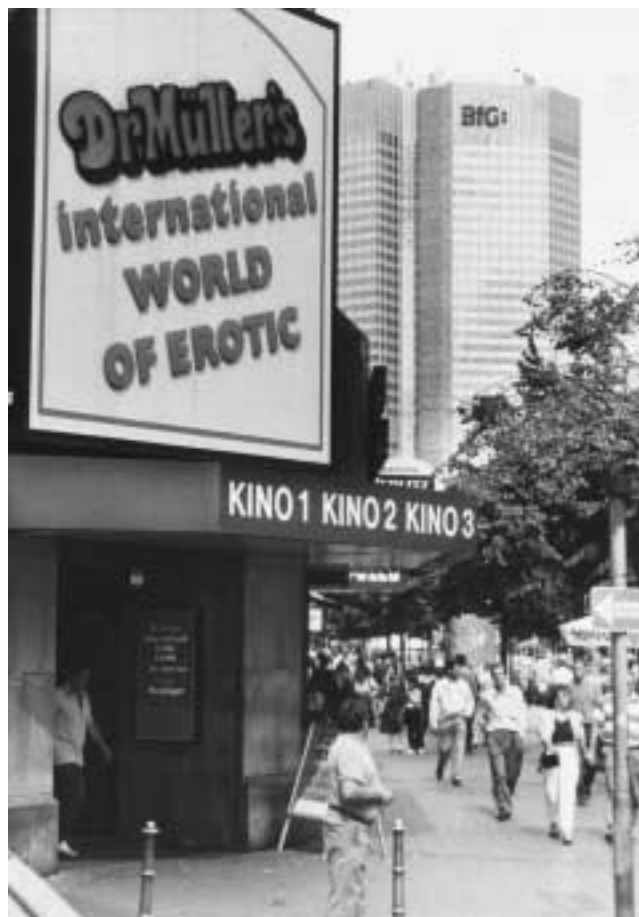
The red-light district in Frankfurt, Germany, located conveniently next to the banking center. The economies of the United States and Germany, among others, have been transformed from producer societies, into increasingly decadent consumer societies.

The utopian policies underlying these patterns reflect, chiefly, two things to be emphasized as the conclusion of this report. First, they reflect the intention of utopians of the Wells-Russell genre, to create utopias in which populations are bred, trained, and culled, to serve as willing human cattle for their feudal-like masters. Drugs and video-game-induced mass-schizophrenia, complemented by what are termed euphemistically psychotropic drugs, will keep the human cattle