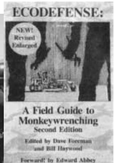
An anti-logging demonstration by the eco-terrorist group Earth First!, in Eureka, California, during the 1990s; and the group's "how-to" manual for destroying industrial machinery.

derived from it, became part of the dogma of the British East India Company's Haileybury School's economists, Adam Smith, Malthus, Ricardo, et al.