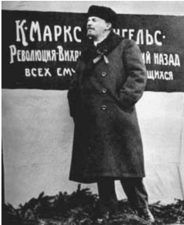
V.I. Lenin, though poorly developed from the standpoint of scientific method generally, nonetheless captured the essence of scientific practice, in his commitment to a "voluntarist" approach to the shaping of history.

intellectual convergence upon radically empiricist currents of British liberal ideology. By defining "socialism," from the start, as the historically fated outcome of developments from within British political-economy, the failures of socialist doctrine, so induced, produced the subsequent failures which led socialist ideologues back to reconciliation with their adopted Benthamite liberal roots.