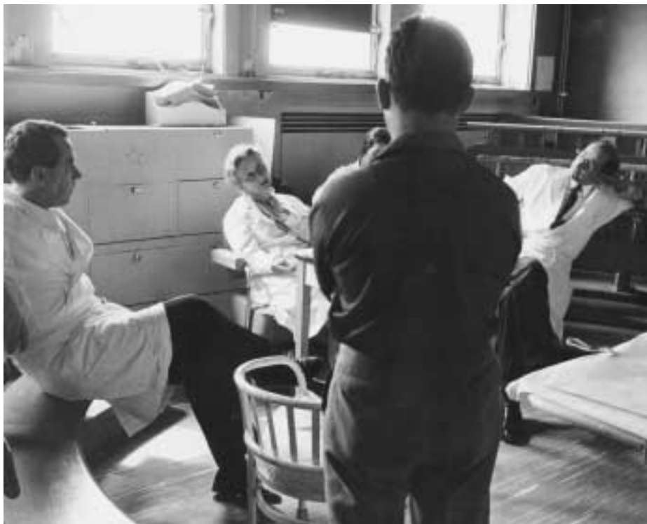
“In the case of medicine, it is the treatment of the patient, not an accountant’s standardized definition of disease and allowed treatments, which is the standard for ethical practice.” Here, a medical team deliberates on the treatment of a cancer patient.

This is not only a needed economic policy. It is also social-political policy. A healthy republic requires not only well-educated young minds. It requires a population with cognitively active minds. To achieve that effect, this social-political policy must be fostered in the daily, weekly workplace, a location in which much of the daily life and energy of the adult citizen is occupied.