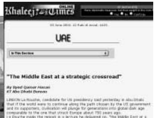
Lyndon LaRouche speaking June 1 to the Zayed Centre for Coordination and Follow-Up in Abu Dhabi, at the opening of the Centre's two-day conference. On LaRouche's right is U.A.E. Oil Minister Obeid Bin Saif Al-Nasseri, and on his left, former Iraqi Oil Minister Essam Abdul-Aziz Al-Galabi. Inset: an Abu Dhabi newspaper reports LaRouche's view on its website.

case, we shall see the implicit strategic potential of the Middle East as the crossroads of Eurasia. Any long-range forecast of the prospects of Middle East petroleum must be studied in the context of that challenge.