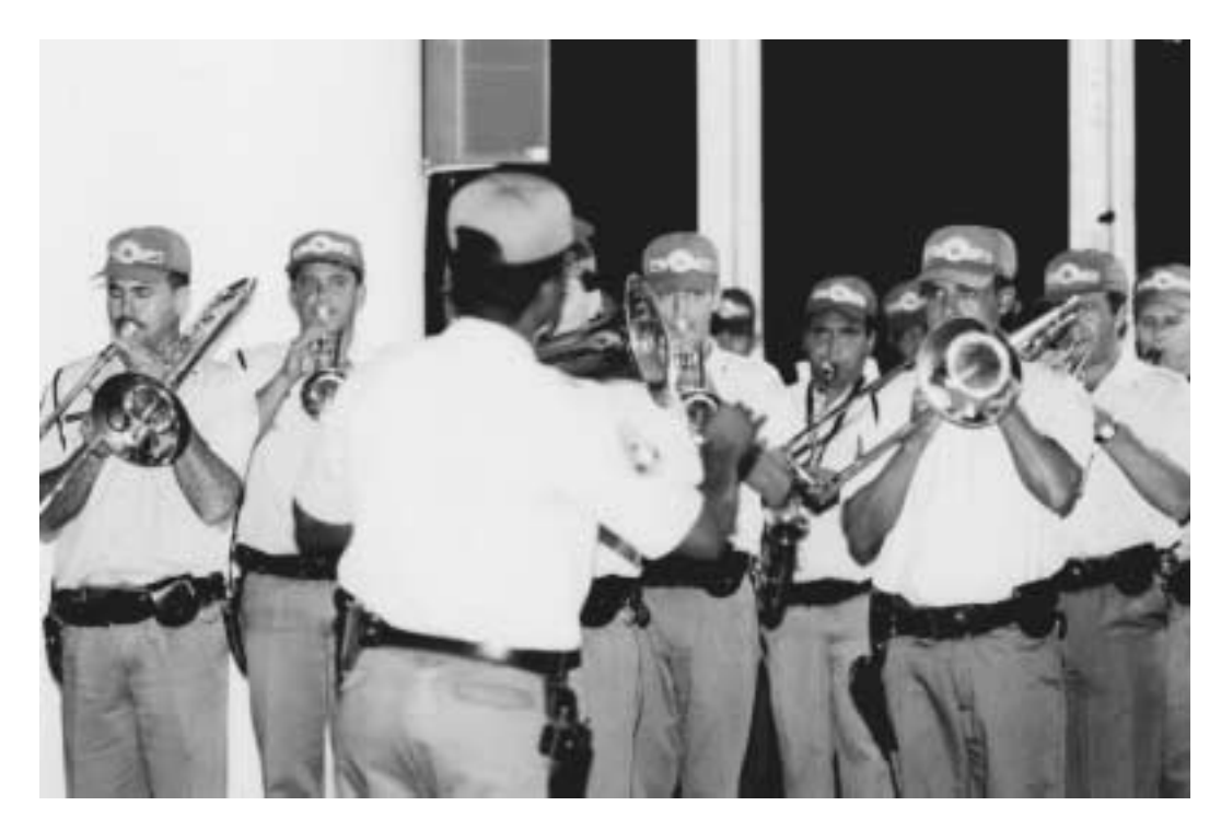
To open the ceremony, a military band plays the national anthem of Brazil. Afterwards, a tenor sang the American national anthem, a capella.

LaRouche has been insisting for decades, and I have been repeating here in Brazil since 1989, the crisis is systemic.