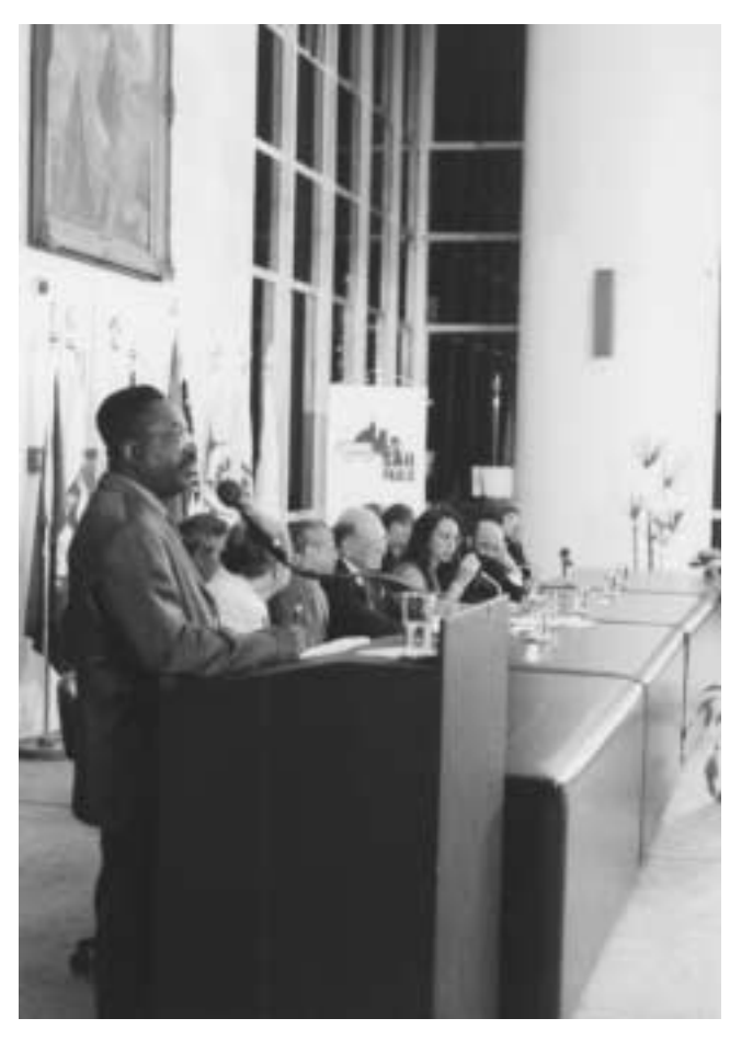
At the dais of the award ceremony in the São Paulo City Council chambers.

our forefathers, and which makes us a sovereign nation.