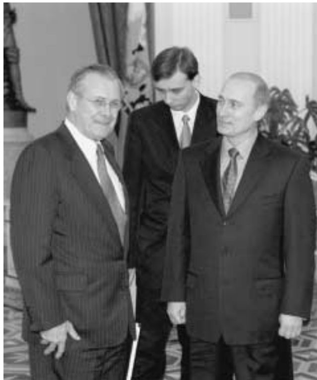
Vladimir Putin (right) with U.S. Defense Secretary Donald Rumsfeld, in 2001. Putin is widely perceived in Russia as refusing to give direction to the nation. As a result, any new move by him—such as his efforts to align with the United States under its current policies—is perceived with suspicion from all ideological camps.

Putin's most devoted colleagues demonstrate a kind of split within themselves. The most obvious example is Dmitri Kozak , deputy chief of the Kremlin Staff, responsible for the reform of law. On the one hand, he is known as a ruthless promoter of financial and legislative centralization, to achieve an abrupt restriction of the power of “regional barons.” But this very person, at the same time, also promotes changes in legislation, to deprive the prosecution of its supervisory duties and convey them to the courts. Ostensibly, this innovation pursues anti-corruption goals, but it is well known that, at the local and regional levels, judges are far more corrupt than prosecutors. Yet, the deputy chief of staff explains that his motive is devotion to human rights! He may, indeed, be quite sincere. Strict control combined with “human rights” (under-