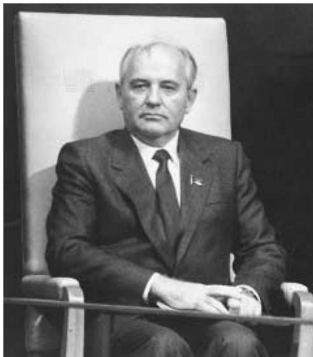
Mikhail Gorbachov, the Soviet Union's last President. Russians today are drawing a parallel between Putin and Gorbachov: The latter disastrously positioned himself "in between" the two artificially planted tribes of the successors to Yuri Andropov.