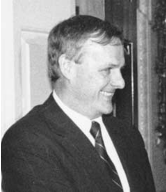
The late St. Petersburg Mayor Anatoli Sobchak, an example of the Russian “schisis”: He launched his career as a parliamentarian by associating himself with Soviet-era dissident Academician Andrei Sakharov; has a mystical affinity for a branch of the Romanov dynasty; became famous for his anti-military rhetoric in 1990; and fled the country in 1997-99 to avoid criminal charges. He was recently honored by Putin with a plaque.