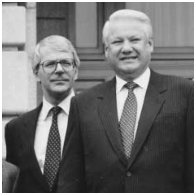
Russian President Boris Yeltsin (right) and British Prime Minister John Major, in 1993. “For the Romanov dynasty, for the Politburo, for the present Russian establishment, misty Albion remains ‘the last resort’ in case of big problems. Especially when these problems emerge from the personal psychology of a Russian sovereign.”

This seemingly contradictory historical phenomenon of a “continentalist” becoming irrationally devoted to the “Island Empire” of Great Britain, and destroying his own country in the process, would be seen again. It was evident in the sophisticated and profoundly misanthropic psychology of Yuri Andropov. It was continued in Politburo member Alexander N. Yakovlev , the so-called “architect of perestroika.” It was reiterated in the generation of Andropov’s grandsons, who put forward Putin as the best choice of a successor for Boris Yeltsin . This last choice of heir (Yeltsin had anointed and dumped several “successors” before), though it was re-