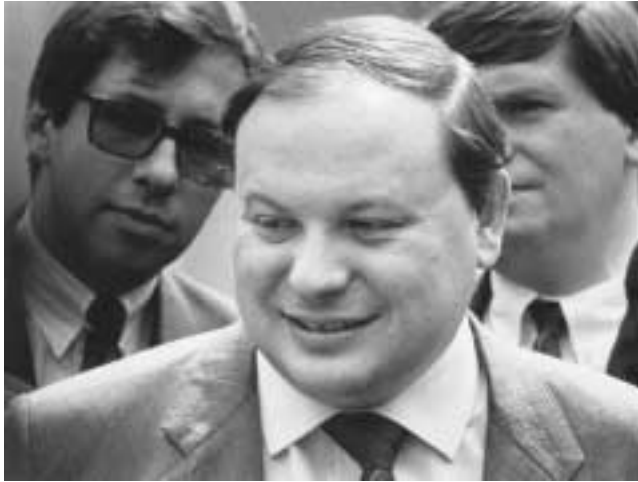
Former Russian Prime Minister Yegor Gaidar, architect of the shock therapy “reforms” after the collapse of the Soviet Union, has his own ties to the KGB apparatus, notably through the person of banker Oleg Boiko—a fact taken for granted by Gaidar’s Western tutors.

you, without mediation by ambitious government or selfish regional officials. A calling, which cannot rely on sophisticated manipulation behind the scenes, nor on skills in private conversation, but the ability to communicate a clear vision in clear language. These are the elements of leadership , which is not equivalent to mere control. To rise to the occasion, would require overcoming this split, collecting the pieces of a broken spyglass in order to achieve a vision of the inherited split, and present a clear view of the future to your people—or else, collapse.