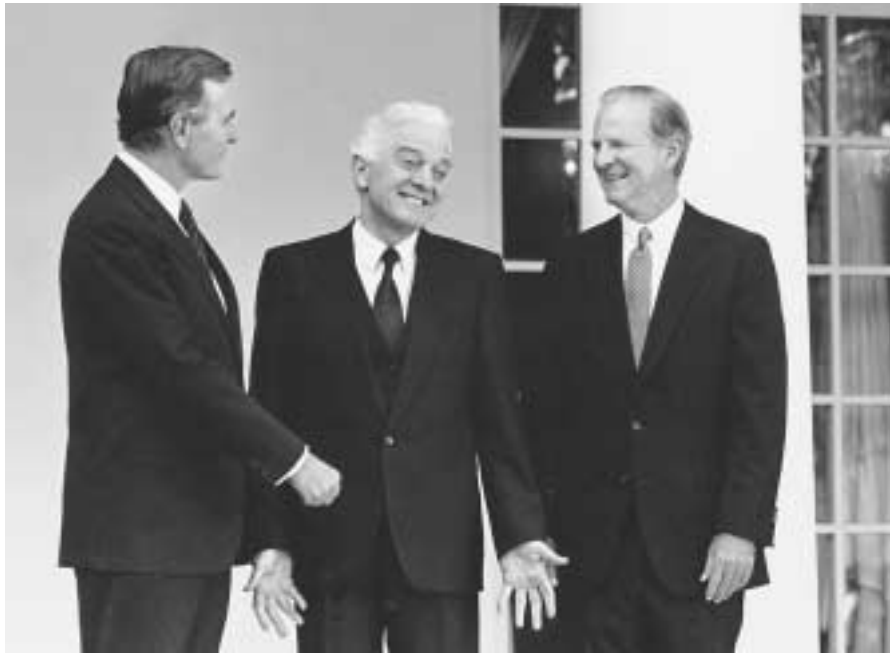
Eduard Shevardnadze (center) as Soviet Foreign Minister, with President George H.W. Bush and Secretary of State James Baker III, 1989. Shevardnadze, the former Georgian security chief, returned to power in 1992 as the President of independent Georgia.

reportedly advised Mayor Sobchak before the latter's flight to France, came closer to the truth when he said that (Andropov's) KGB saw itself as the "historical alternative" to the CPSU, because the KGB was capable of taking spiritual lessons from the most intellectual of the Soviet dissidents, whom the KGB would take on as indispensable partners in decision-making.