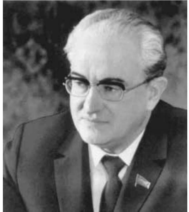
The late Soviet Communist Party General Secretary leader and longtime KGB chief Yuri Andropov was honored by Vladimir Putin, shortly after Putin came to power, with a plaque on the wall of the headquarters of the former KGB: a sign of the bewildering contradictions among the Russian elites today.

cially, social revival. The Interregional Group of Deputies, grouped around the aged Academician Sakharov, included Doctor of Sciences (Law) Anatoli Sobchak, then a professor at Leningrad State University (since renamed the University of St. Petersburg).