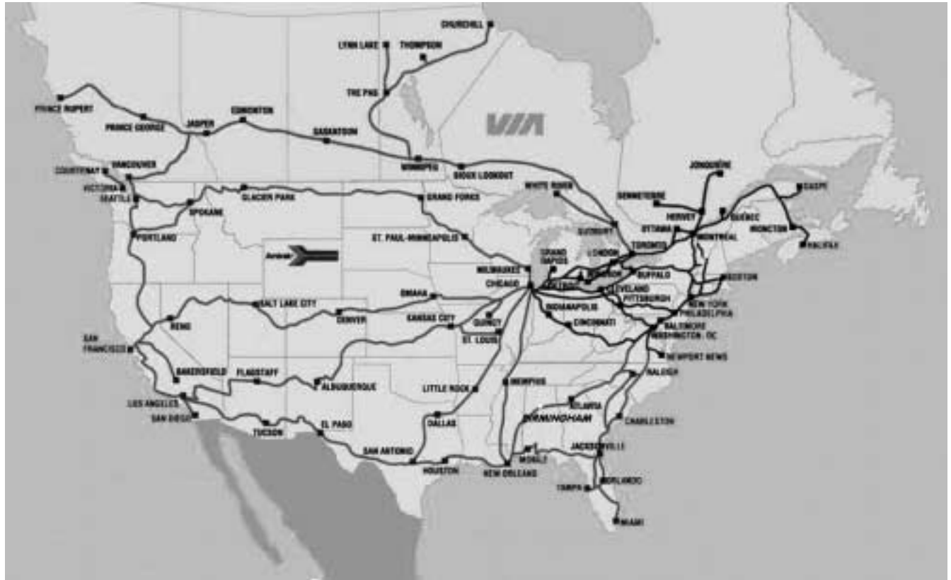
The routes of the Amtrak passenger rail system, all that remains of an American passenger-rail network that was once 50% larger, is now threatened with shutdown for lack of funds, or with being sold off and stripped down further as planned by the neo-conservative Amtrak Reform Council and Sen. John McCain. See report on p. 38.

concentrated in their residences around areas where they either had employment, or were otherwise likely to find replacement employment. So, therefore, you had people living in a community, which would often be defined by a group of major employers, as well as all the other auxiliary employers, of small machine shops and so forth, that went with it. So, you had a sense of community. And you had a primary motion, in the course of the day—whether shopping, or going to work, coming from work, going to school, meeting with neighbors, these kinds of connections—were all within a fairly restricted area, almost within walking distance, if not absolutely within walking distance. And this was achieved, partly by having an efficient mass-transit system, which enabled us to do that.