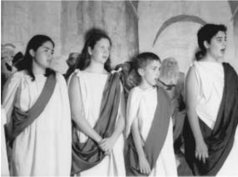
The student who has been trained in Classical culture, reliving the creative discoveries of the past, has a solid foundation to understand universal history as well as physical science. Here, at a Schiller Institute Summer camp in Lucketts, Virginia, in July 2002, children painted a life-size mural of Raphael's "The School of Athens," and gave a performance of drama and song, based on Plato's Dialogues.