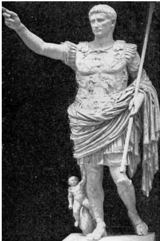
The first Roman Emperor, Caesar Augustus. The danger that confronts us now, is that we will be trapped in a Roman imperial-style, no-win, perpetual war by the Cheney Chickenhawks’ utopian fantasies.

Thus, to realize the social-control objectives of the utopians, the U.S.A. and Europe had to be transformed from reliance upon technologically progressive forms of physical-goods production and professional health-care services, to the