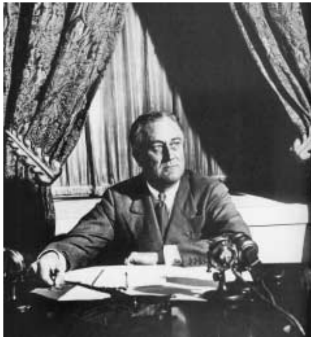
Franklin Delano Roosevelt before his first Fireside Chat, March 12, 1933. Roosevelt was a true leader, with the fire of the anti-Tory American System in his belly, "a deeply ingrained historical knowledge of and belief in Hamilton's anti-Adam Smith, American System of political-economy."

To provide the leadership needed, to cause such a team to be rallied, some kindly guardian angel, or a reasonable approximation of such a personality, must be brought in to succor the imperilled Presidency. At this instant of writing, I am playing the part of that lurking guardian angel. I come, as did Dickens' Old Marley to Scrooge: the unwanted but familiar apparition, to tell the President what he needs to be told, the tough truth, for his own good, and for the good of the nation, too. With an appropriate team, he might succeed, if someone else supplies the spark which sets the team into creative motion.