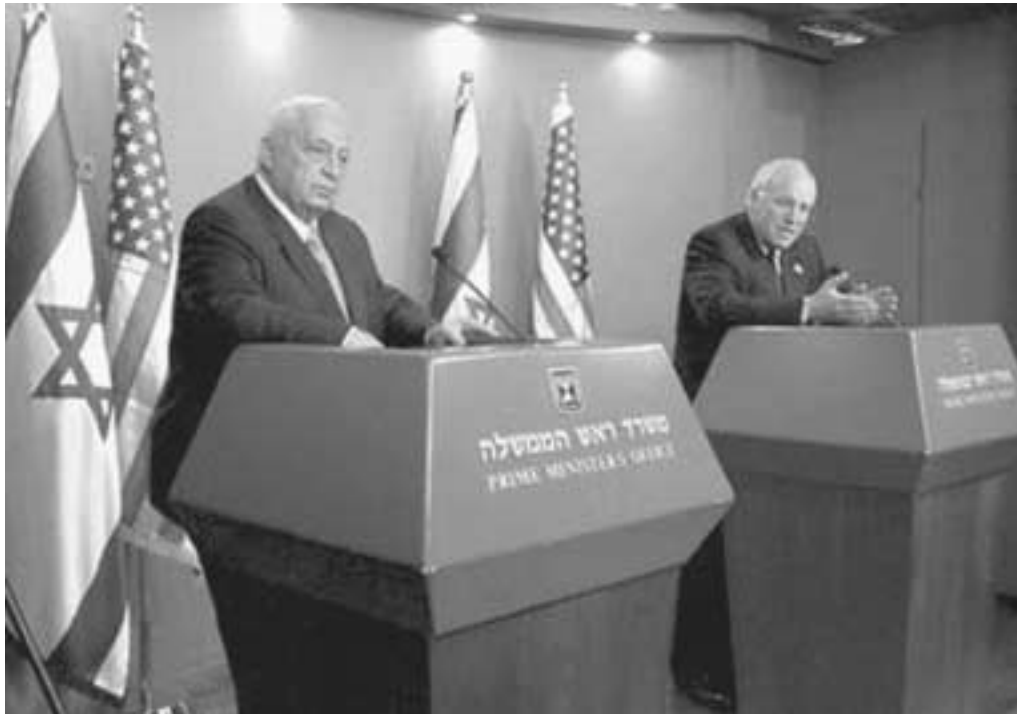
Two obstacles to a peaceful resolution of the U.S. current crisis: the President should take the resignation of Cheney (right), and must force the government of Ariel Sharon (left) not to blackmail the United States into war.

great Speaker of the House Henry Clay, President John Quincy Adams, economist Henry C. Carey, President Abraham Lincoln, and others. Such heroes are typified, more recently, by President Franklin Roosevelt. In this manner, through all our crises, those brought from without, and those spawned from within, our republic has survived, during two centuries in which no constitution of any nation of continental Europe has lasted more than a few generations.