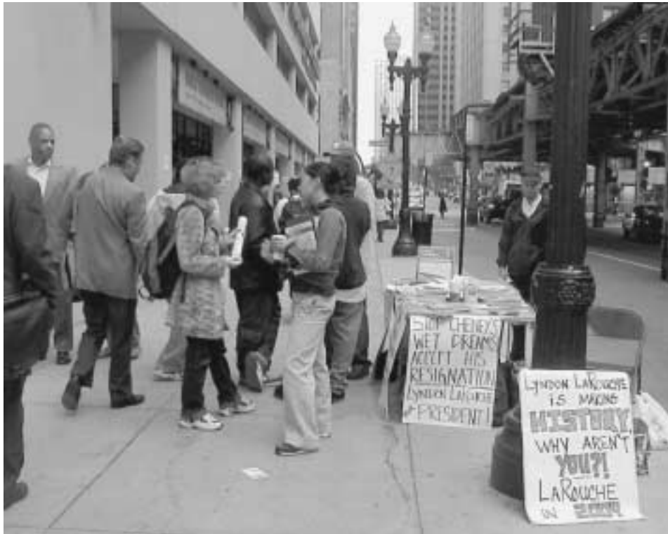
Citizens gather around a LaRouche organizing table near Washington College in Chicago, where they are challenged on their responsibility for “national security,” and for acting with an exceptional leader to change history.

on the throne. This conflict is a variable degree of problem. Where the influence of Classical culture and scientific progress are relatively more influential, popular opinion prizes accomplished and dedicated leading personalities, and Classical art. When a society is relatively depraved, it esteems the worst strata of exemplars, in leading personalities and art, to represent the little-mindedness of that nation as a whole.