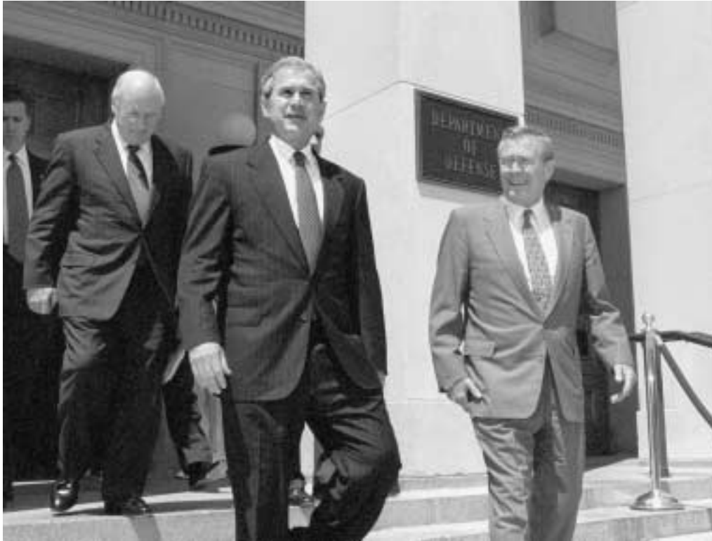
President Bush, shadowed by Vice President Cheney. The President must free himself from the grip of the awful lies being foisted upon him by Vice President Cheney's and George Shultz's Chickenhawks.

parties' altogether disgusting, Summer 2000 nominating conventions. As long as it appears the job is getting done, the negligent citizen sometimes breathes an irresponsible sigh of relief when a President has quit office, shrugging his shoulders, "We got by; but, I am sort of relieved that he is gone. Let us hope that the next one is no worse." Usually, then, he votes for the next, as foolishly as he did for the last. Nonetheless, all considered, our republic has survived, until now.