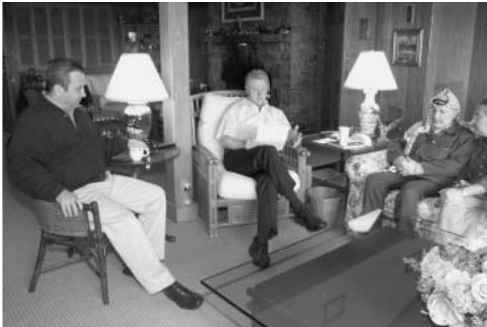
President Clinton with Prime Minister Yehud Barak and President Yasser Arafat, at Camp David, July 25, 2000. "By substituting a compromise of principles for a correction of principles, we produce, as in the case of the Clinton-Barak negotiations, compromises leading into a breakdown of the negotiations based upon what were essentially unprincipled, pragmatic designs."

fruitless form of an unjustified war, one which is inherently not worth fighting at such a price. In religious and ethnic wars, such as Ariel Sharon's war upon the Palestinian population, we see the worst variety of cases. By starting one's study of the issues of war and peace from that sort of warfare, as a point of reference, all of the issues of security of nations and peoples come together in a common point of reference. The name of the topical heading under which that study should proceed, is ecumenicism : How are the combatants of religious or ethnic warfare brought to desire to cease killing one another, especially in warfare where opposing general populations are engaged at close quarters, as in "land wars in Asia"? With what spiritual motive could one defeat the evil religious motives behind the present drive toward such warfare?