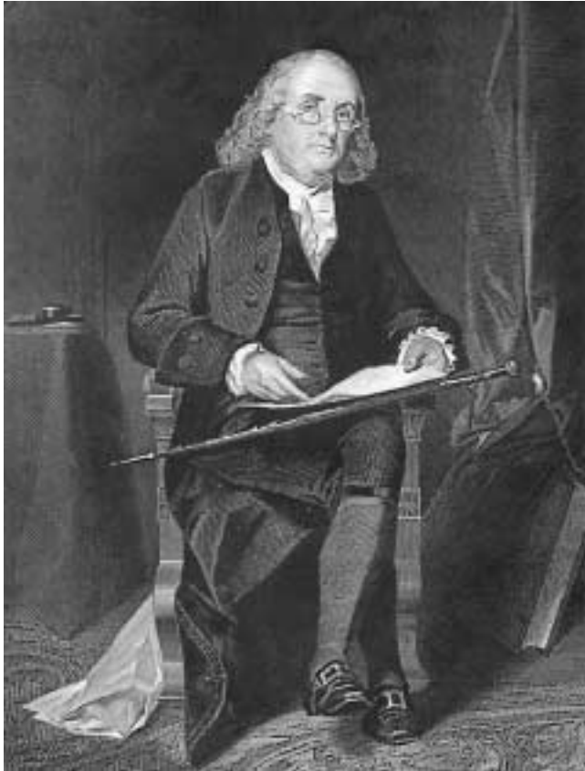
The true father of our republic, Benjamin Franklin, the Franklin who was the guiding hand behind the crafting of such Constitutional instruments as the 1776 U.S. Declaration of Independence and the 1789 draft of the U.S. Federal Constitution.

what was known, since 1763-1789, to the present day, as “The American Tories.” Those Tories are a faction rooted, historically, in chiefly foreign, chiefly Anglo-Dutch, Venetian-style financier interests. These Tories have been expressed as a faction often allied with the traditions of slaveholder interest, and, to the present day, with heritage of the British East India Company’s drug-trafficking interest.