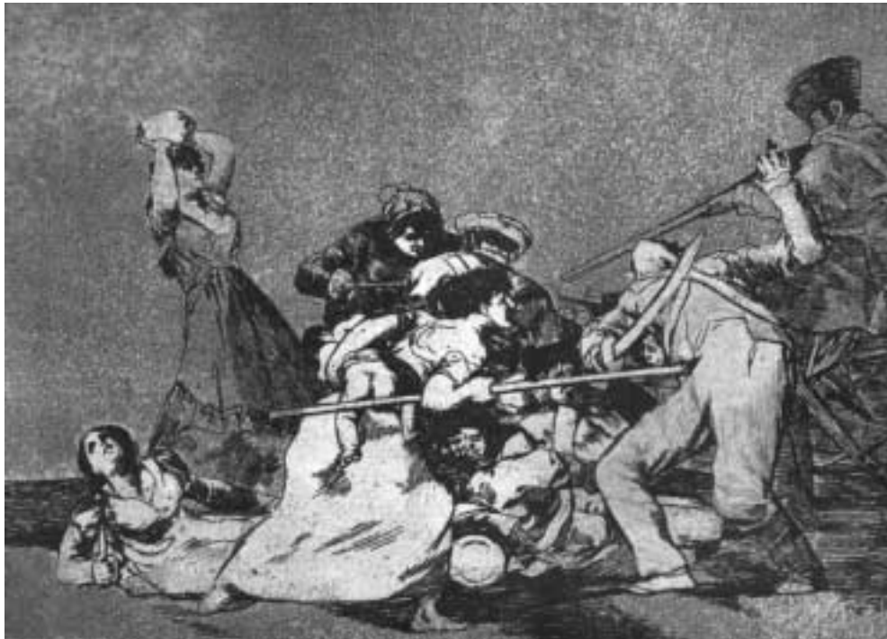
“The religious warfare in Europe . . . 1511-1648, the devolution of the U.S. war in Indo-China, the ultimately suicidal lunacy of continued Israeli “religious” warfare against the Palestinians, and the prospect of a U.S. land-invasion into the cities and other territories of the densely armed population of Iraq, are examples of wars in which your neighbor, indigenous or invading, kills you, and you him.” Here, Francisco Goya’s image of Napoleon’s disastrous invasion of Spain.

we say we are seeking “a compromise”? A careless approach to ecumenicism may obtain compromise at the price of compromising the integrity of the deep sense of personal identity among one or each of the participating parties. The principled, systemic issue here, is the essential part of the individual’s sense of personal moral-intellectual integrity within the framework of a specific culture. Remove that sense of personal integrity, and his next spate of rage will muster not a man at war, but a caricature of a man, a predatory beast gone mad.