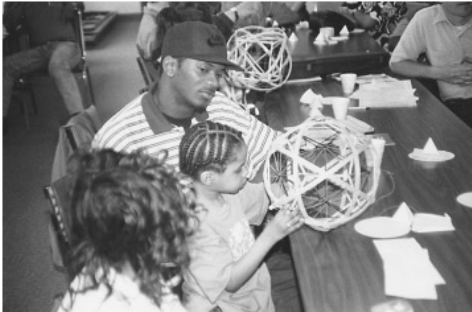
A Schiller Institute geometry workshop in Boston. A humanist education begins with the investigation of physical principles which point to real-life facts, contrary to an abstract classroom geometry—the issue upon which Gauss clashed with Euler and Lagrange.

of Lagrange’s effort to systematize physics as a system of mechanical action located within the Euclidean-Cartesian domain of empiricists such as Abbot Antonio Conti.