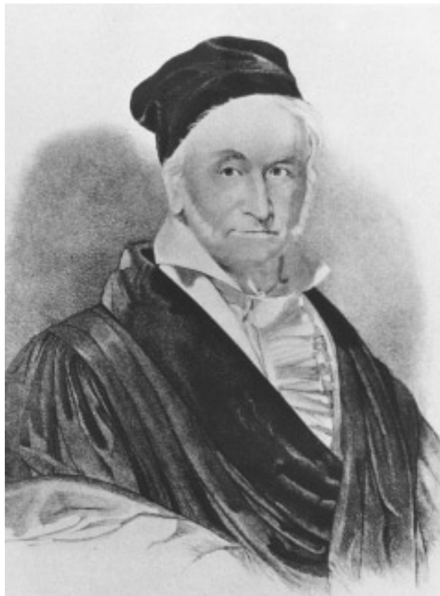
Carl F. Gauss's 1799 report of his discovery of the fundamental theorem of algebra, is "the point of reference for launching a well-organized, coherent approach to both the history of physical science and a science of history."

The first objective in education, is to guide the self-development of the mind of the student to the vantage-point that he or she recognizes truthful knowledge, such as the reenactment of an experimentally validated universal physical principle, as a uniquely human state of mind. For that reason, during the assembling of the present youth movement, I introduced the proposal, that the crucial benchmark of reference for secondary and undergraduate higher education, should be a mastery of the broader implications of Carl Gauss's 1799 report of his discovery of the fundamental theorem of algebra. For crucial historical reasons, as I have explained the significance of this earlier, it must be that 1799 report, in which Gauss attacks the common epistemological follies of d'Alembert, Euler, and