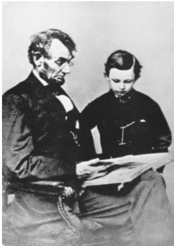
Abraham Lincoln with his son Tad, 1864. “When history takes the proper turn,” writes LaRouche, “the cultural development accomplished by the successive work of the grandparents and parents, blossoms in the achievements of the grandchildren’s generation.”

ment of today’s policies without looking at the effect of those policies on the condition of both that nation, and also the world, over a period of not less than approximately two generations ahead. In other words, he or she must think of the trajectory of human development, as the original discoverer of gravitation, Johannes Kepler, defined the annual orbit of the planet Earth. For that reason, the morality of each adult generation, is to be measured by its attitude toward its own adolescent or young-adult children, an attitude which must be measured, at each point in time, as the effect of that attitude