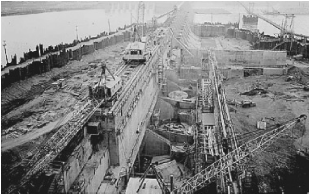
Construction of a dam and power plant by Roosevelt's Tennessee Valley Authority in 1942. Such state-organized public works can supply an effective degree of relative (Riemannian) physical-space-time curvature to the domain within which the relevant private enterprises are situated.

entrepreneur, as farmer or manufacturer, does not disregard the role of large corporate enterprises. However, we must recognize the danger inherent in the role of a profit-interest which seeks to divorce itself from a sense of primary accountability to the public, rather than merely private (e.g., “shareholder” interest). On the latter account, the state must circumscribe the corporate form of for-profit private enterprise with its own adopted devotion to some adopted mission of benefit for society in general, and also impose governmental regulations which channel its behavior into conformity with that adopted, authorized corporate mission. In this example, in as the role of basic economic infrastructure, in economy in general, the primary site of performance is the economy considered as a coherent unit, rather than a sum-total of parts. The whole must be a source of added benefit to the local function, as the local function must be a contribution to the essential mission-function of the society as a whole.