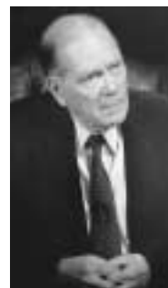
EIR Contributing Editor, Lyndon H. LaRouche, Jr.

gives subscribers online the same economic analysis that has made EIR one of the most valued publications for policymakers, and established LaRouche as the most authoritative economic forecaster in the world.