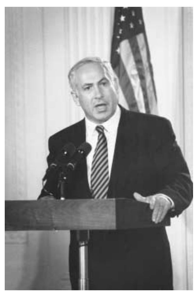
The illegal money flows into Israel to support the Likud, have been equally for Sharon's factional rival and former Prime Minister Benjamin Netanyahu, as for Sharon and his faction.