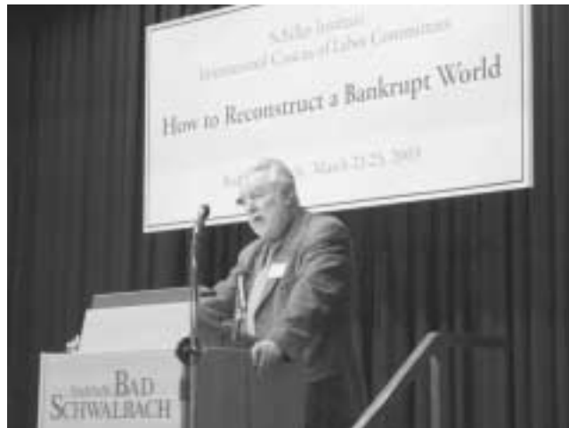
Russian Academician Vladimir Myasnikov: The interaction of the countries at the center of Eurasia “must be put on the solid platform of economic and science-technology cooperation.”

The situation is presented most fully and clearly in the Resolution of Sept. 25, 2002, passed by the Italian National Parliament, with regard to authorizing the government to take measures that would help Argentina to overcome the crisis. The Parliament proceeded from recognition of the fact that escalation of the banking and financial crisis, which started from crises of 1997 in Asia, Russia, and Latin America, and has lasted through to the recent failure of the “new economy” in the United States, the massive and, so far, lasting banking collapse in Japan, and the bankruptcy of Argentina, cannot but cause concern in all countries—among the population,