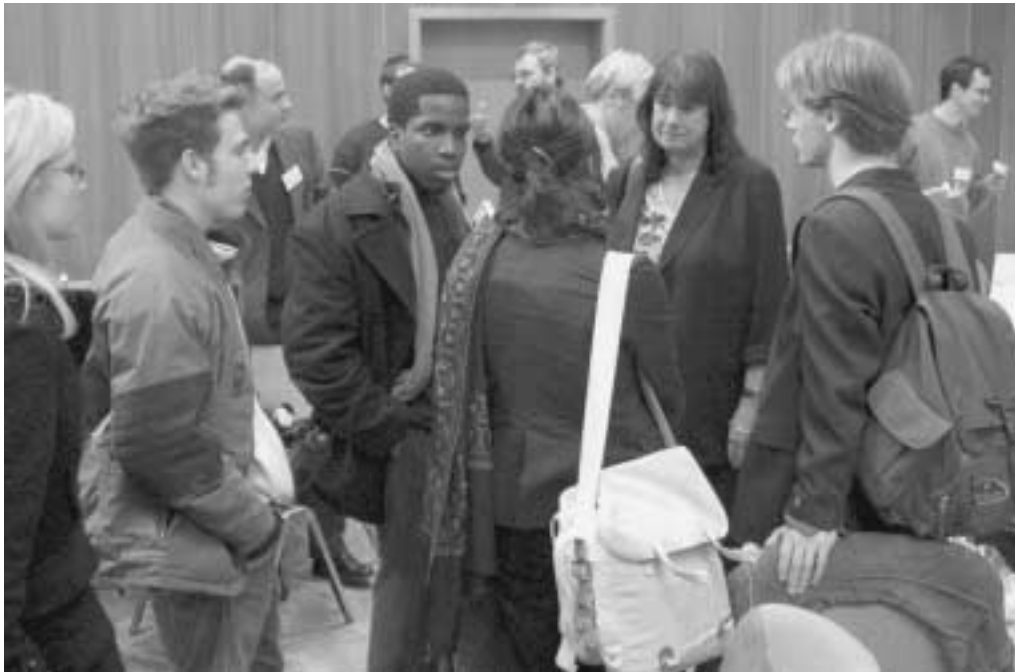
Helga Zepp-LaRouche (center) with youth participants at the Schiller Institute conference. The Eurasian Land-Bridge, she said, “will not only lead to an economic miracle, but it will transform humanity out of the present state of barbarism.”

goes, “Seek ye knowledge, though it be in China!”