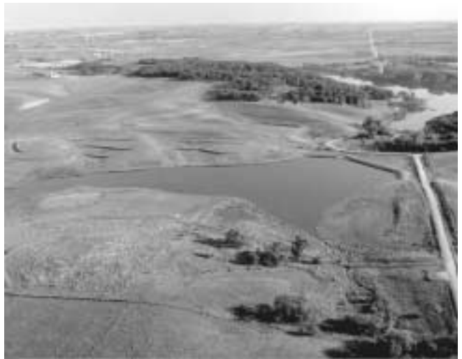
America has 85-90,000 dams in its official inventory. There are the large mainstream—usually “downstream”—dams on major rivers, almost all the responsibility of the U.S. Army Corps of Engineers, such as the Willow Island Lock and Dam on the Ohio in West Virginia (left). On upstream sites, some 11,000 smaller—“watershed”—dams have been built through the partnership between the U.S. Department of Agriculture and local watershed project sponsors. Shown is a small dam and lake in Tama County, Iowa, with terraces, grass plantings, buffer strips, and other conservation measures.