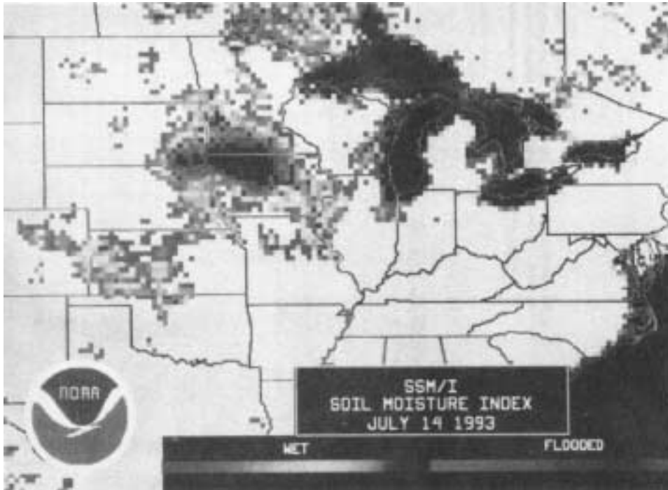
A 1993 satellite photo shows “Lake Iowa”: River flooding had left so much soil moisture that Iowa showed up like a sixth Great Lake. Yet even within and around Iowa then, Peterson recalls, watersheds with full local water management plans and structures were far less affected than the rest of the state.