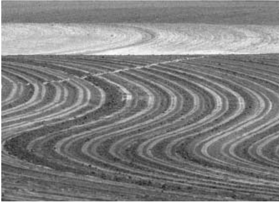
Contour farming is a basic part of the work of the USDA-assisted Soil Conservation Districts and watershed basins—one of many land- and water-preservation measures which are done before the district implements the “last resort,” building a dam, if necessary.

EIR: Besides the obvious merits of having well-maintained, safe working dams and water control systems, there is the huge benefit of creating jobs through the rehabilitation of dams. We are in a very serious economic crisis.