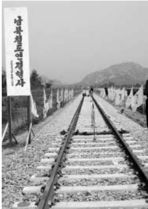
The potential for large-scale economic development of Asia is demonstrated by this historic June 15 ceremony, linking the railroads of North and South Korea for the first time since the Korean War. The chicken-hawks are trying to sabotage such moves toward reunification.

in discussion with China on one of the largest water projects in the world, the Brahmaputra power project, on the borders of Tibet and Assam.