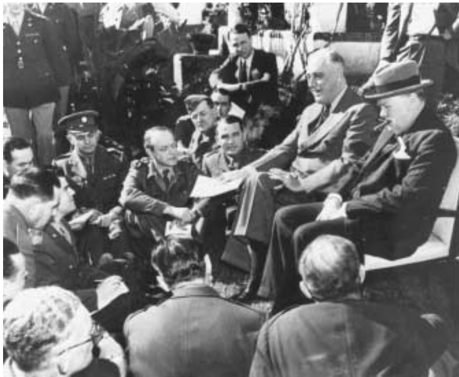
Franklin D. Roosevelt with Sir Winston Churchill at Casablanca, January 1943. Their wartime alliance was a very difficult one. Churchill saw the threat from the Synarchist/fascists, and appealed to the United States for help; but here, at Casablanca, Roosevelt told the outraged Churchill that he intended to free the colonies after the war—including Britain's colonies.