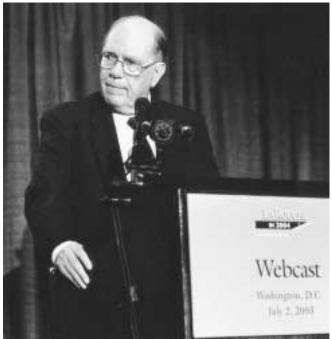
With the imminent total collapse of the present world monetary-financial system, LaRouche said, “this means we’re at a turning-point in world history, comparable to the crisis periods of the 1930s, but much more severe.” Here, the LaRouche Youth Movement campaigns in California on June 5; LaRouche delivers his webcast speech in Washington on July 2.

employment on long-term projects financed through the European Investment Bank, which will be outside the monetarist control of the European Maastricht agreements, the so-called Stability Pact agreements.