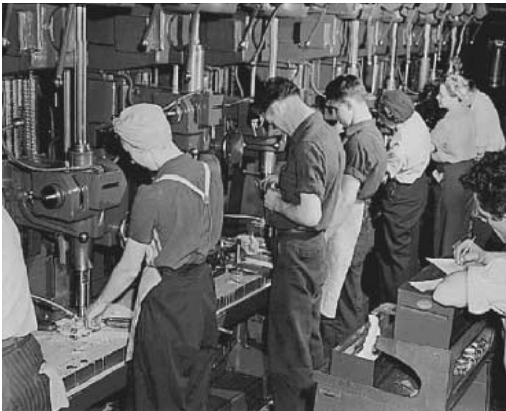
The Roosevelt era offers a model of how unskilled, uneducated people can be quickly upgraded in a national mobilization. Here, both men and women were trained to run the machines that turned out parts for America's bomber planes at a plant in Willow Run, Michigan, in 1942.

movement, but it has a purpose. I'm trying to revive the United States, and revive the world. I'm trying to reverse the Baby Boomer syndrome, of the decadence which took over the population of the United States, especially from 1964 until the recent time. Because we don't have, as you see with the leadership of industry, politics, and so forth today, these guys—we have to work with them, but I'm telling you, relative to my generation, they aren't there. They're stumblebums when it comes to managing things. And most of you who are older, know it. They're not worth much. Sometimes they try to do well, but they simply don't have the ability to judge a situation effectively, to provide good leadership.