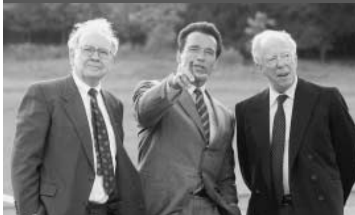
On Sept. 5, EIR featured the “Three Stooges,” left to right: Warren Buffett, Arnie Schwarzenegger, and Lord Jacob Rothschild, at Rothschild’s Waddesdon Manor in England in September 2002.

And, they were now moving, by the occupation of France, to take over the French Navy, hopefully the British Navy; they already had an agreement with the Japan Navy. Their plan was, to take England, to take the United Kingdom, into this fascist alliance—with the aid of the Laval and Vichy governments in France, which were already in the works, they were part of the Synarchist operation. And, to immediately eliminate the Soviet Union. And then, having this combination of navies, of the French, the German, the British, the Italian, and the Japanese Navy, they planned for an attack on the United States, which the Japanese carried out, in fact, on Dec. 7, 1941.