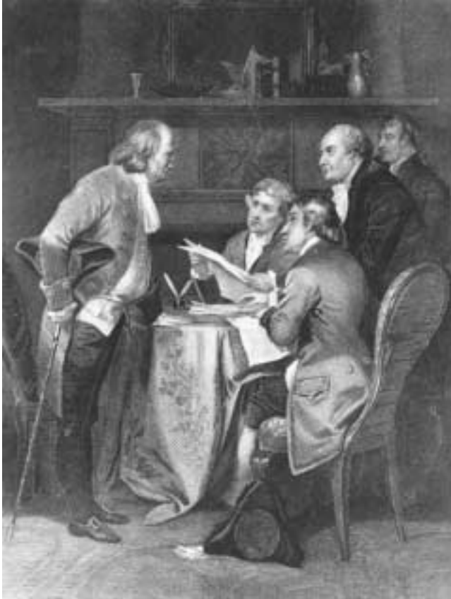
The father of the United States, Benjamin Franklin, supervises the drafting of the Declaration of Independence. (Thomas Jefferson is second from the left.)

into motion, through his agents in Switzerland and France—especially French-speaking Switzerland, especially around Geneva, Lausanne, and around Lyon in France—set into motion a cult, which became known as the Martinist freemasonic cult: of Cagliostro, of Mesmer, of Joseph de Maistre, and so forth. This cult.