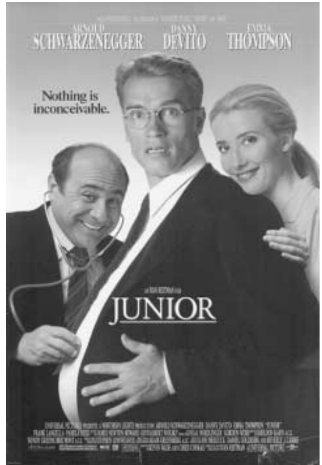
Schwarzenegger, the freak-show act. In the 1994 film Junior , he plays a scientist who impregnates himself with a frozen egg.

Therefore, if we try to build any system of government on this planet, which does not recognize that, does not recognize the importance of the sovereignty of the nation, in terms of its choice of culture, and the participation of its people in its culture, we will create a monster which will fail us.