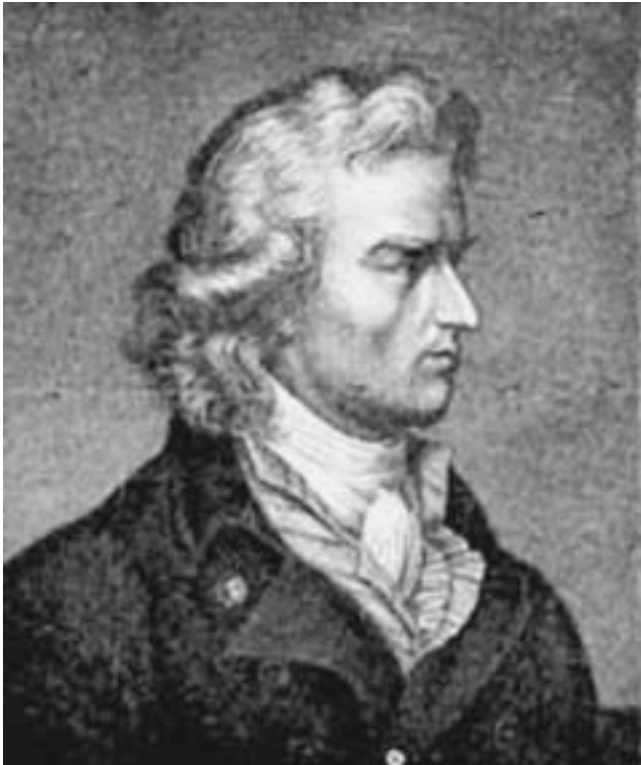
Friedrich Schiller, the “poet of freedom,” based his famous Classical tragedies on the human quality of the Sublime. “The same kind of notion of the Sublime applies to social processes, as the discovery of the principle of the modern nation-state republic, as defined during the Fifteenth Century, provided the needed escape from those imperial traditions of Rome and its successors which condemned the great mass of humanity to the status of human cattle.”