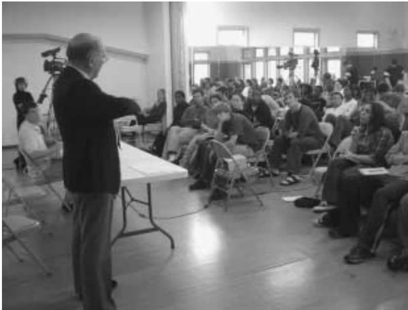
Lyndon LaRouche addresses the cadre school in Philadelphia on Nov. 1. “The key thing here is emotion. Emotion should not be treated as some irrational thing, contrary to reason, as reason is misdefined. But rather, we must look at emotion critically, to define what are sane, and insane, forms of emotion, and then judge the rest of the policy from that standpoint.”

are produced in countries which engage in cheap labor, such as China, or other countries. So therefore, when Wal-Mart gets a bigger impact in an area today, employment in that state and region collapses , because firms are shut down, because Wal-Mart won't buy from them. Why? Because they're producing with U.S. labor. It's one of the big factors in unemployment.