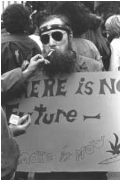
A Baby-Boomer proclaims, "There is no future," in this New York City "pot parade" in 1981. The children of the Boomers are, increasingly, unwilling to accept the fate their parents' hedonism has handed to them.

them, which had been living before, went away; became part of the counterculture. The first thing, the most immediate thing that turned adolescents or late adolescents, in the 1960s, into Baby-Boomers, was the fear of—number one: the Missiles Crisis of 1962, and the effect it had on them and their parents (they were old enough to be scared; they were not old enough to judge the situation); the assassination of Kennedy; and the beginning of the Indo-China War—a hopeless war, which they had no confidence in, no belief in.