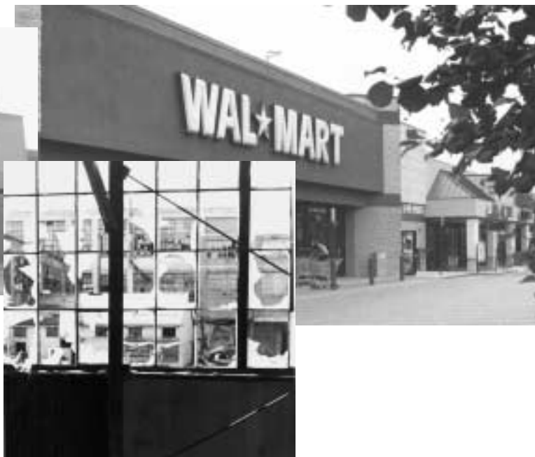
Wal-Mart is one of the biggest factors in causing unemployment in the United States, by squeezing out competitors with cut-rate prices, banning unions, eliminating U.S. vendors, and relying on imports produced by virtual slave labor abroad. Left to right: retailer Montgomery Ward closes in Michigan; the wreckage of a factory in Buffalo, New York; and Wal-Mart—“not a company, but an epidemic disease.”

financial market, which was specialized in this kind of thing, would organize a run, like a George Soros-type game, against some country—the way George Soros went at, particularly, Malaysia. They drive down the value on the international market—the trading value—in an orchestrated money market, like a rigged casino; they drive the value of the currency down on the international money-exchange market. Then, authorities go to the country and say, “Well, bring in the IMF! Bring in the World Bank, to advise you on how to deal with this problem.” The IMF would come in, and give the “advice” (or the World Bank): “Devalue your currency! Twenty, 30, 40, 50%!” Say, “Okay, we’ll do that, if that’ll work.”