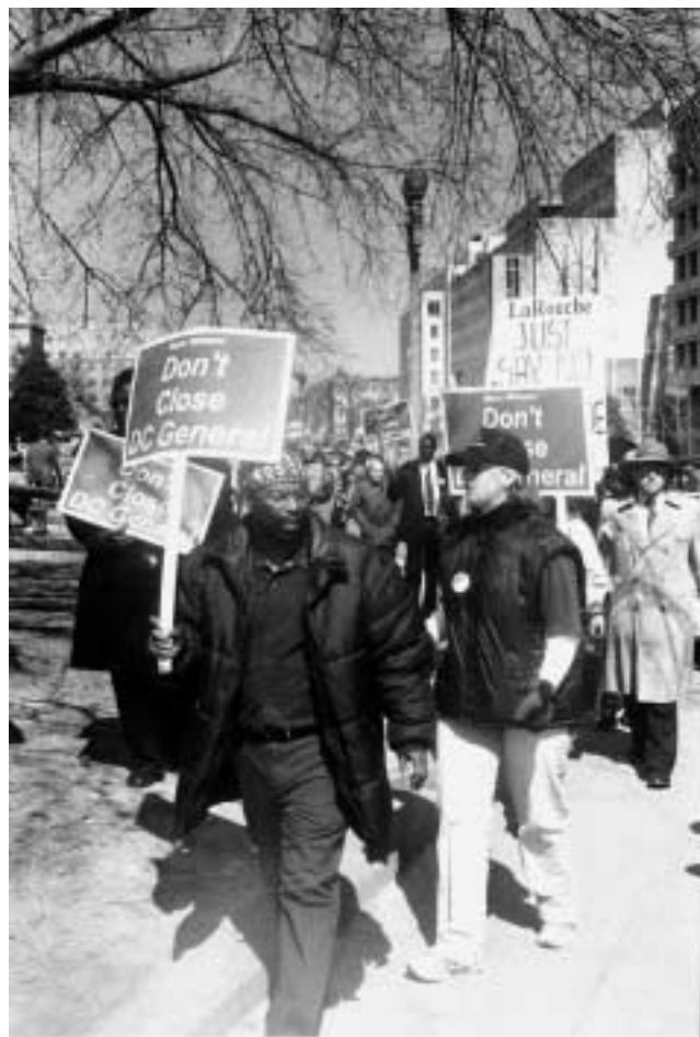
The LaRouche forces built a movement to save D.C. General Hospital (here, a rally on March 8, 2001). “The first hour I’m President, in the office, I will issue a Presidential order, setting into motion the immediate re-establishment of D.C. General Hospital. . . . At the same time, I will issue to Congress a Presidential directive, requesting the Congress to repeal HMO and restore the Hill-Burton law.”

And I think the American people, generally, are sick and tired of these damned bills! They don’t mean anything. They’re simply ways of saying, “Look, I did this! I gave you