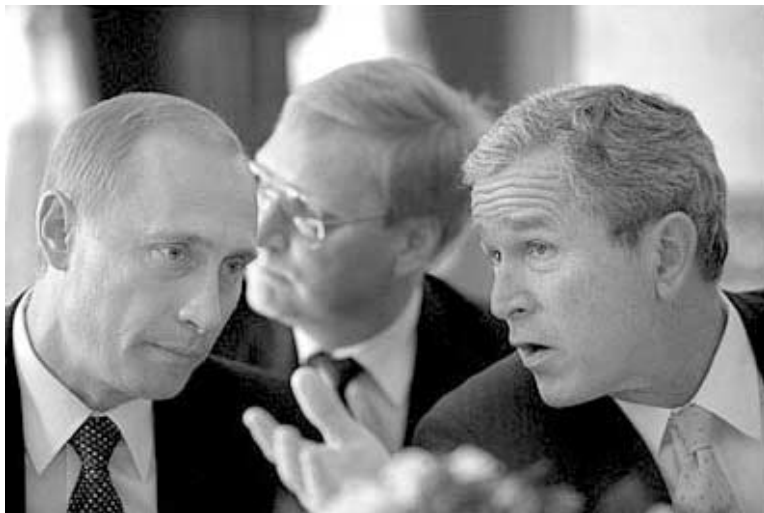
As a President from a ministerial—not political—background, Vladimir Putin views Russia's relationship with the United States as a primary concern. While seeking to cooperate with the United States, he also confronts the reality that the world is heading toward war, unless the policy of the neo-conservatives in Washington is changed.

Now, therefore, that's key to understanding the issue of the Yukos oil question, which is what's the Khodorkovsky case. Putin is working as an institutional person. Putin is a former member of the Foreign Service of the KGB, the Rus-