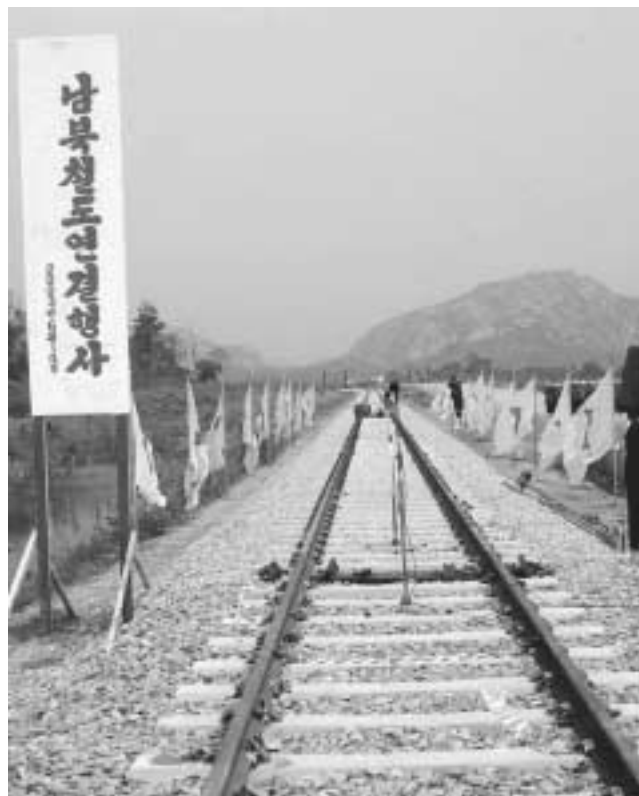
Promise of the future: the newly re-connected Trans-Korean Railway recedes off into the mountains of North Korea, as seen from the Military Demarcation Line at the center of the DMZ on June 14, 2003.

Kim also highlighted “the regained popularity of the Trans-Siberian Land-Bridge” (which had fallen out of use due to the International Monetary Fund’s destruction of Russia’s