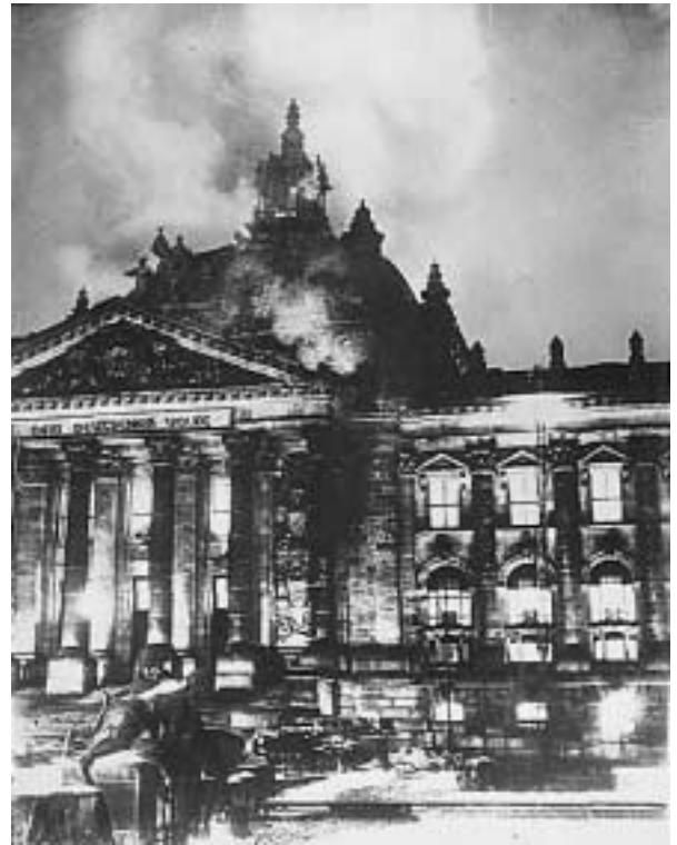
Lyndon LaRouche warned, in opposition to the nomination of John Ashcroft (left) as Attorney General in January 2001, that Ashcroft would seek a pretext for unconstitutional rule by emergency decree, just as the Nazis did after the Reichstag Fire of Feb. 28, 1933. Months later, the terror attacks of Sept. 11, 2001 provided that pretext.

Qaeda/Arab terrorists, but was an attempted coup d'état, with the indispensable role being played by forces inside the United States. He wrote: