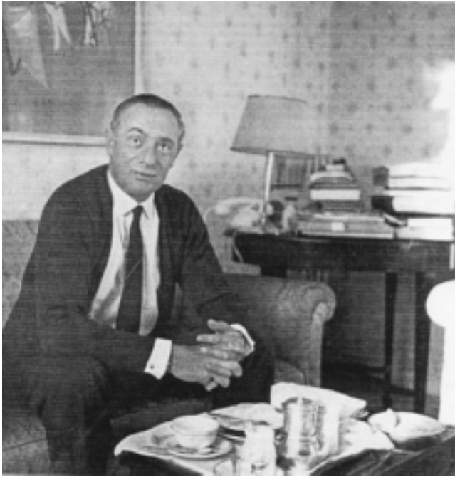
Enrico Mattei, the economic leader and nationalist who was killed in October 1962, the same month as the Cuban missile crisis. His assassination was a turning point in Italian history, the beginning of what became the strategy of tension.