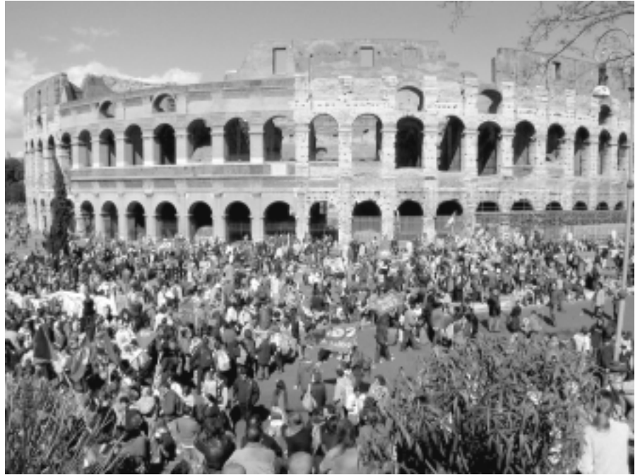
The CGIL trade union federation sponsored this demonstration against terrorism in Rome on March 23, 2002. Under the "strategy of tension," dating back to 1969, right-wing fascist networks ran terrorism under a "left-anarchist" cover, and with high-level protection both inside and outside Italy.