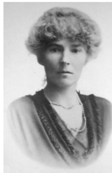
British occupation military commander Sir Arnold Wilson (left) represented the "arrest and kill" strategy for ruling Iraq, similar to Defense Secretary Donald Rumsfeld's pronouncements today. Liberal imperialist and British government representative Gertrude Bell (right) was part of T.E. Lawrence's ongoing "coup" against the British India school; she cultivated pro-British Iraqi "elites." But she found RAF bombings of Iraqi villages during the 1920 revolt "fascinating."