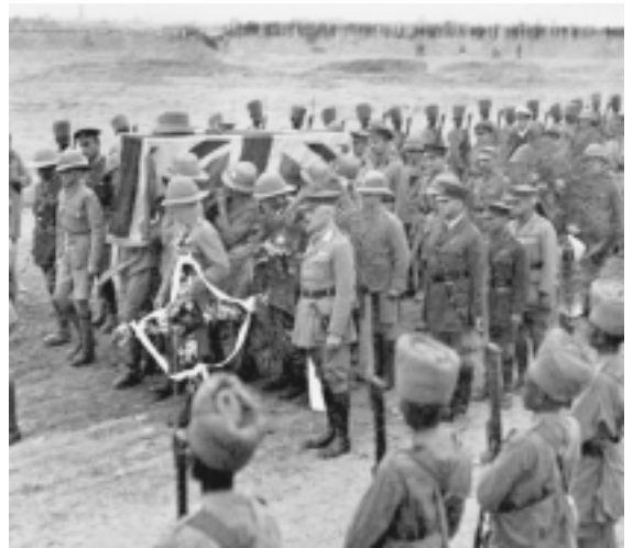
After a British invading army had been besieged and surrendered in 1916, the second British invasion of Iraq, in 1917, “succeeded” because the Ottoman Turkish imperial regime had meanwhile fiercely oppressed Iraq’s Shi’ites, generating great opposition to Ottoman Rule. British Maj. Gen. Stanley Maude’s troops finally captured Baghdad on March 11, 1917 (left). Maude was to be buried under the city’s wall seven months later (right).

declaration included the demand of “affording mutual guarantees of political independence and territorial integrity to great and small states alike.” An Arabic copy of Wilson’s declaration was published on Oct. 11 of that year, and widely circulated in Iraq. Point 12 received special attention: “XII. The Turkish portion of the present Ottoman Empire should be assured a secure sovereignty, but the other nationalities which are now under Turkish rule should be assured an undoubted security of life and an absolutely unmolested opportunity of autonomous development.”