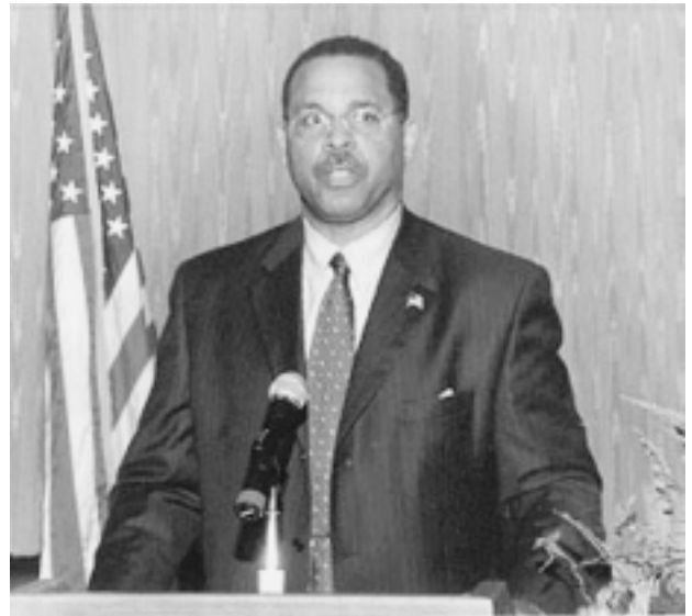
The Tempe, Arizona Presidential debate was one of dozens of occasions on which President Bush lied about his intention to loot the Social Security fund for Wall Street. Not so accidentally, J. Kenneth Blackwell (right), Ohio chief of elections (and of Bush's campaign) who oversaw vote suppression throughout that state to re-elect Bush, was active in developing the Social Security privatization schemes Bush is now openly pushing.

history. Guided by the General Welfare principle of the United States Constitution, FDR created a universal retirement insurance policy—not a speculative investment plan—at very modest cost, one which will soon have worked with great success for a century, despite illegal looting of the Trust Fund for decades to pay for general Federal budget deficits—more than $500 billion looted this way on George W. Bush's watch.