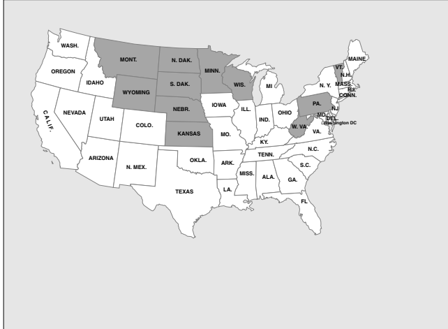
FIGURE 1.1 1969: 14 States Had Federal Legislated Minimum Hospital Beds Per 1,000