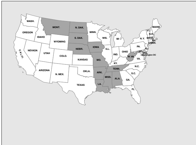
FIGURE 1.3 1990: 13 States Had Federal Legislated Minimum Hospital Beds Per 1,000