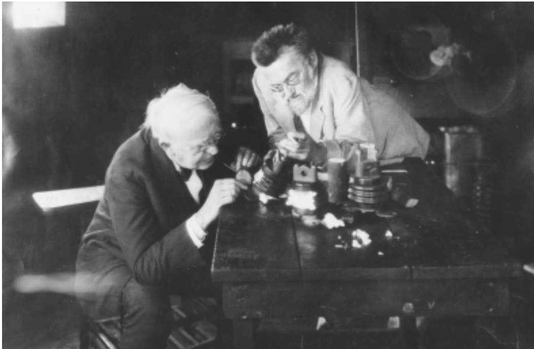
Scientist Thomas Edison (left) with engineer Charles Steinmetz, in 1922. The divorce of the “science” of economics from the reality of physical productive processes, has led to the current catastrophic breakdown crisis.

political-economy which defined a durably successful design of modern economy, beginning more than two hundred years ago.