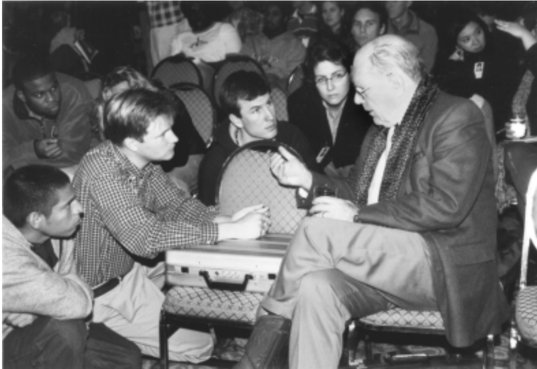
LaRouche with organizers from his youth movement. He challenges them to master the principles of the complex domain, as elaborated by Gauss, Riemann, and others, in order to understand “the way competent modern physical science represents both the difference and connection between the real universe and the shadow-world of sense-perception.”

from a presently onrushing disaster, which touches the heart of a scientific quality of professional practice of physical economy. As an illustration of the latter point, take a key feature of my just-issued report on the prospects of a recovery, which I have just issued as a motion presented to the members of the U.S. Senate. This present report is crafted as a technical supplement to that report.