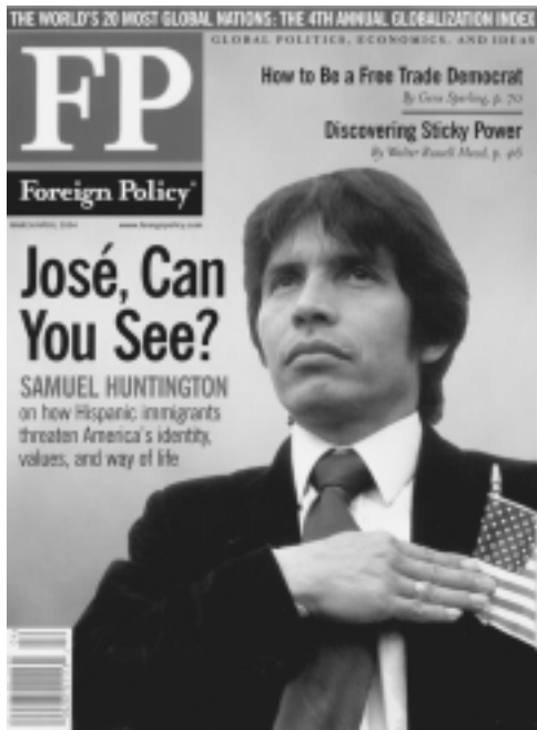
The real economic and cultural war: between the synarchist bankers' faction which is giving big play to Samuel Huntington's new attack on Hispanic immigrants (left, in the Carnegie Endowment's Foreign Policy magazine); and Lyndon LaRouche's policy of open borders with FDR-style infrastructure and economic development spanning North and South America.