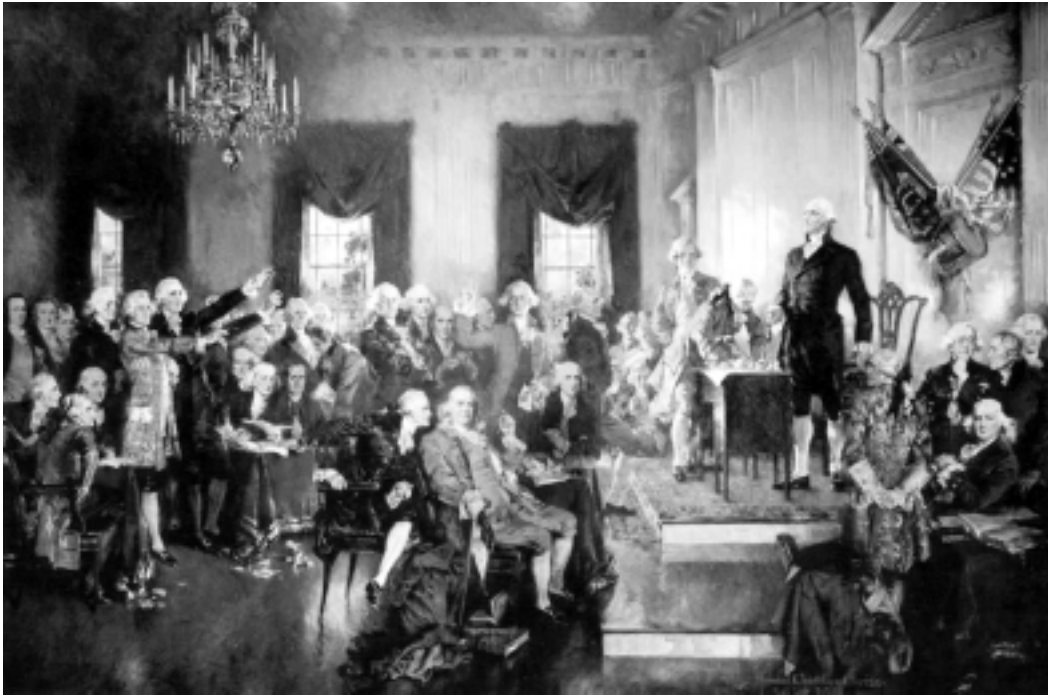
“The U.S.A. was built by Europeans.” The principles of the commonwealth and promoting the general welfare, affirmed by the Council of Florence (1431-1445), were the inspirations for the U.S. Declaration of Independence and the 1789 Federal Constitution, Here, George Washington presiding over the 1789 Constitutional Convention, as depicted by Howard Chandler Christy.