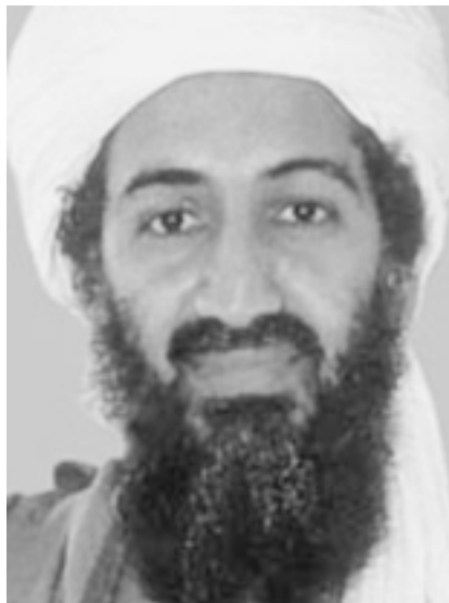
FBI Ten Most Wanted Fugitives list