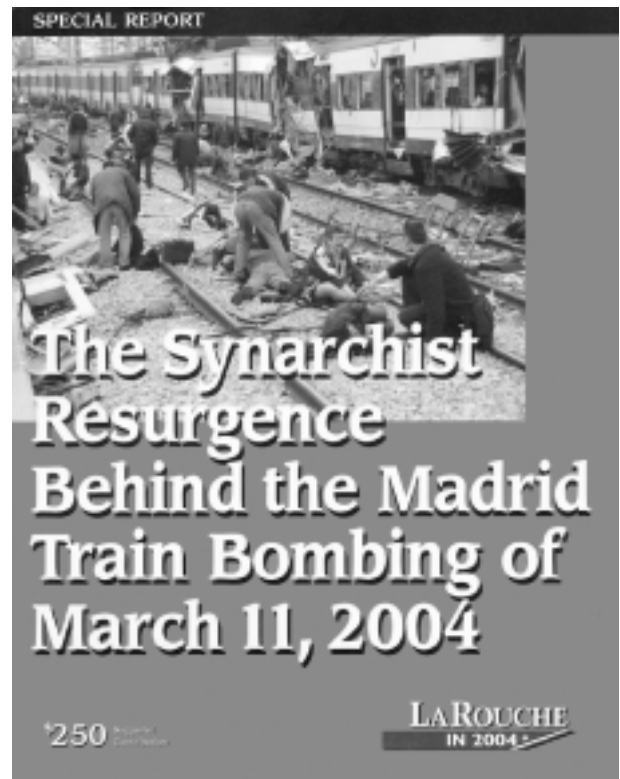
LaRouche in 2004

Beware of fallacies of composition, LaRouche says—a warning that also applied in the aftermath of the Madrid train bombing in March 2004. Here, the LaRouche 2004 Presidential campaign’s Special Report on “The Synarchist Resurgence” behind that bombing.