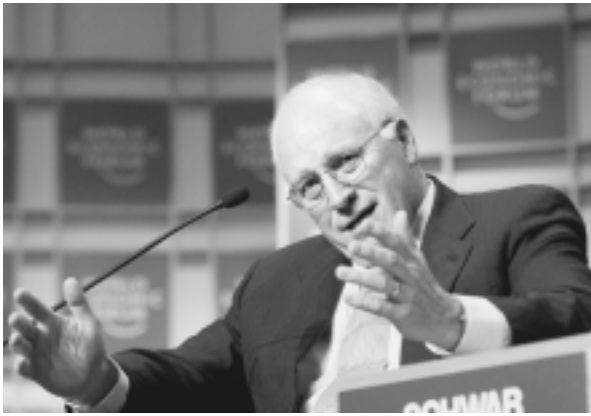
World Economic Forum