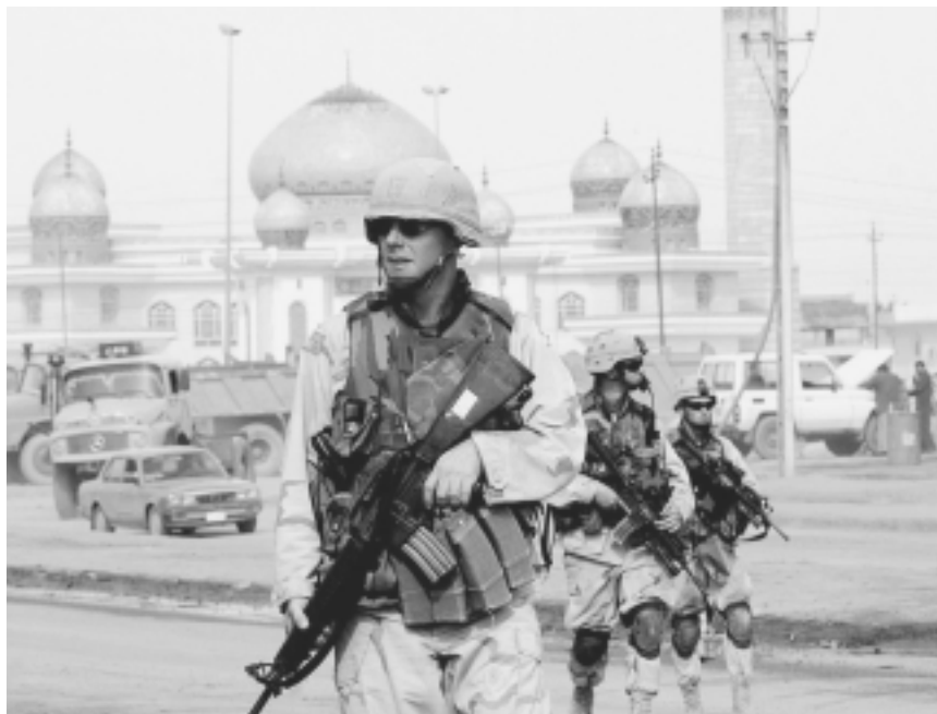
U.S. Army/Staff Sgt. Charles B. Johnson

I was sent to prison after a series of attempted legal frame-ups in January 1989, little more than six months before the Soviet system collapsed. Thus, just a little more than six years after my February 1983 forecast of "about five" years, the Soviet system began its disintegration. It is also notable, that