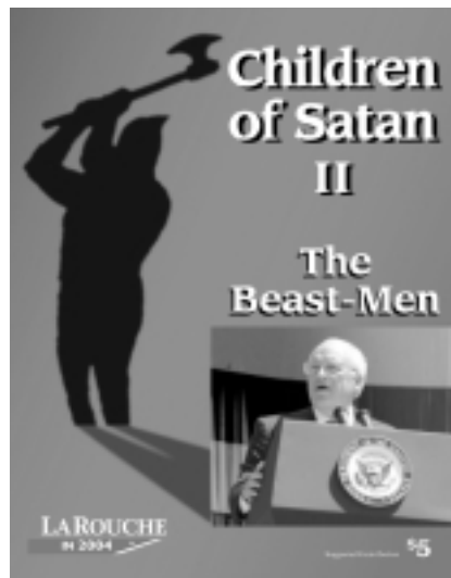
LaRouche in 2004

The LaRouche in 2004 Presidential campaign circulated millions of these pamphlets, exposing Dick Cheney and his "beast-men." Cheney's importance lies in the function he performs as a mere tool of his higher-level Synarchist masters.