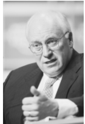
World Economic Forum

Cheney is admittedly more of a dumb brute than his predecessors such as Mussolini, Göring, Goebbels, and Hitler, “but he shares the same kind of passion, without the burden of excess intellectual powers.”