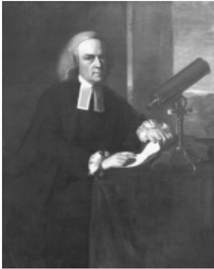
Harvard University Portrait Collection