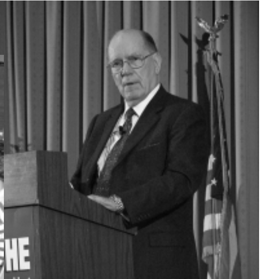
The intervention of LaRouche and his youth movement at the Boston Democratic Convention in July 2004, shown here, radically changed the course of the Democratic election campaign, and the party itself.

down, period. Down! And under present policies, there is no result except a general collapse of the system—which has been ongoing ever since then. Under those conditions, I said—this is before the inauguration of Bush—under those conditions, we must expect, first of all, a worsening of the economic situation; and secondly, we must expect soon, an event like that of Hermann Goering setting fire to the Reichstag, to give Hitler dictatorial powers. And then, on Sept. 11, 2001, we had a Reichstagsbrand . And Hitler Bush, and Hitler Cheney, walked in that day, with prepared dictatorial powers in the true Crown Jurist Carl Schmitt tradition, in that tradition!