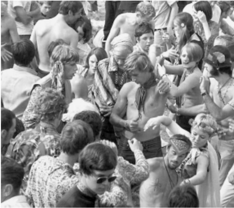
The 68er counterculture had its antecedents in pre-Nazi Germany: “What was the proposal? Shut down society. Go out on the street, take your clothes off, and fornicate with anything you find in the street. . . . We had countercultural phenomena in the 1920s, in Germany, for example, which was the key basis for building up the Nazis.” Here, Woodstock, 1969.