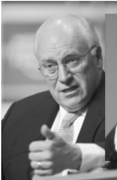
World Economic Forum swiss-image.ch/Remy Steinegger