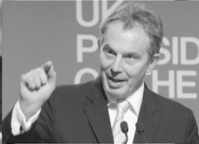
Council of the EU