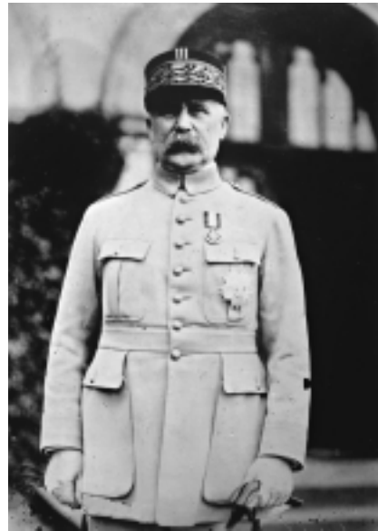
Library of Congress

In fact, rather than support Putin, who now quotes Franklin Roosevelt as a policy example to his nation, France has chosen sides with the financial interests engaged in dismantling our own nation!