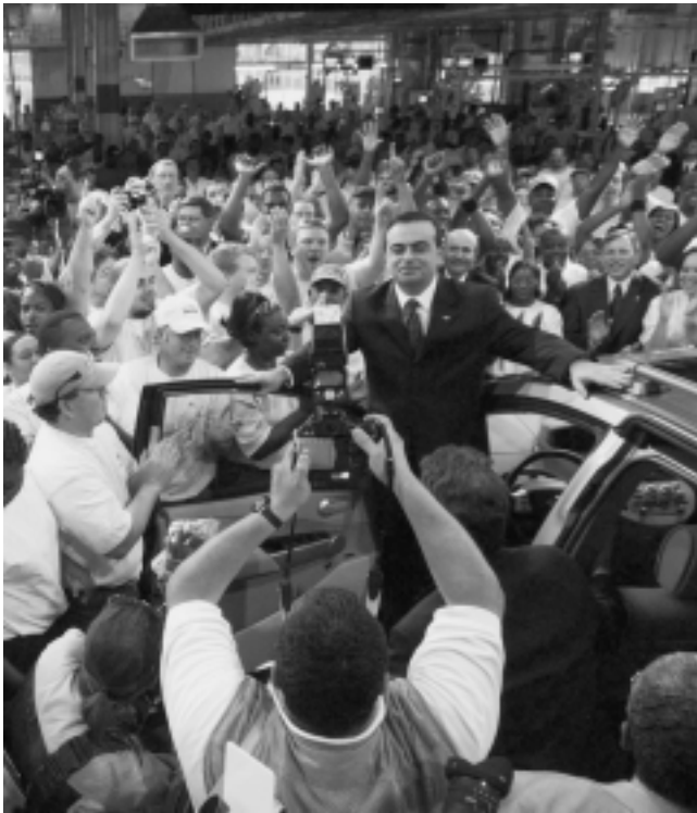
Nissan Motor Co.

Nissan's CEO Carlos Ghosn (standing on car) at the company's Canton, Mississippi auto plant, where he has shredded wages and benefits. Now this lizard has his claws pointed at General Motors.