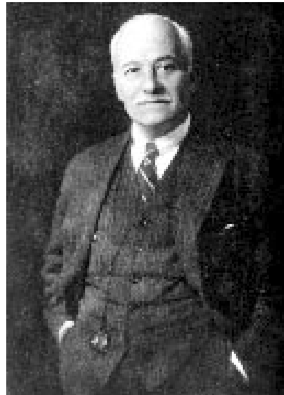
Sir Henry Deterding, Royal Dutch Shell chairman, who admired Hitler and financed the Nazi Party, via his Lazard banker.

Carlos Ghosn , Renault-Nissan's chairman, has just received an offer from General Motors (GM), via the unsavory billionaire Kirk Kerkorian of Tracinda fund fame, who became General Motors' major shareholder, with 9.5% of its capital. The agreement will apparently cover GM and Nissan. As it happens, GM is currently being picked to the bone for hard cash by the financial sharks, for whom